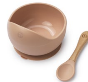
Blushing Pink 60245101151NA