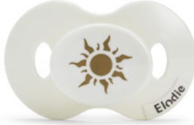
The Sun 30100155866NA