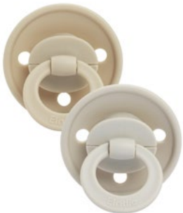
Pure Khaki 30106102116NA