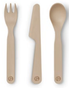
Blushing Pink 60265104151NA