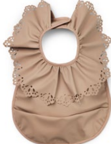
Faded Rose 30400135150NA