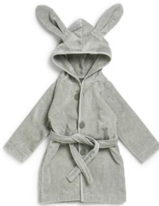
Mineral Green 70665103184EF