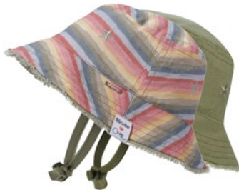
Rainbow Trails 0-6m: 50590105501DC 6-12m: 50590105501DD 1-2y: 50590105501DE 2-3y: 50590105501DF