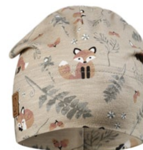
Nordic Woodland 0-6m: 50570102598DC 6-12m: 50570102598DD 1-2y: 50570102598DE 2-3y: 50570102598DF