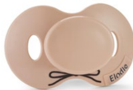
Faded Rose 30100131150NA