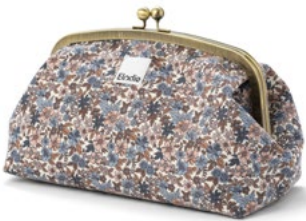
Blue Garden 70610200410NA