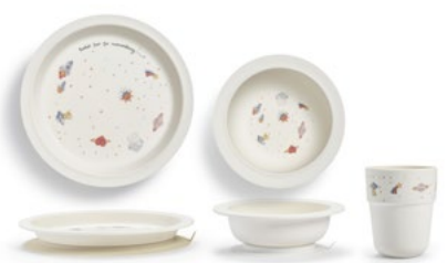
Playground Spaceland 60261101499NA*