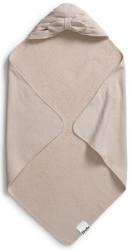
Powder Pink Bow 70660129152NA Timeless