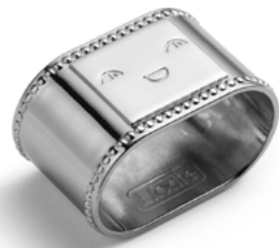
Silver 60270101360NA Timeless