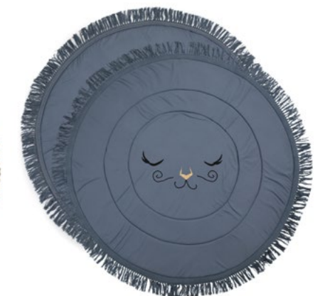
Tender Blue 70830116190NA Timeless