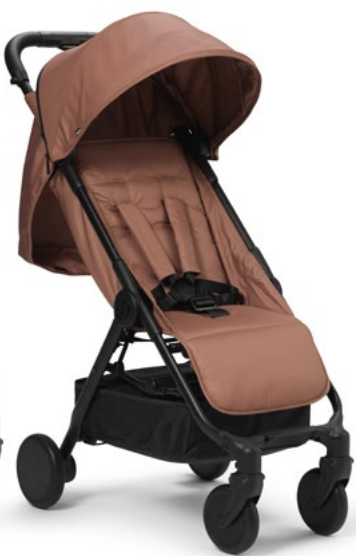
Burned Clay 80820132155NA