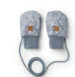
Mittens Free Bird 0-12m: 50620202412EC