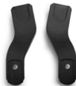
Elodie Mondo Car Seat Adapter 80820111120NA