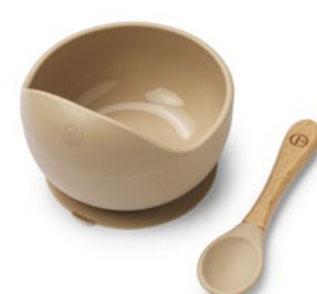
Pure Khaki 60245102116NA