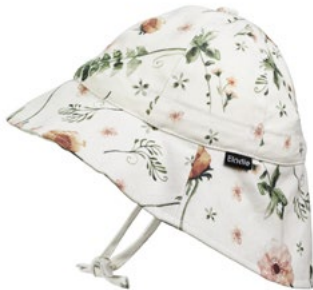
Meadow Blossom 6-12m: 50580132588DD 1-2y: 50580132588DE 2-3y: 50580132588DF