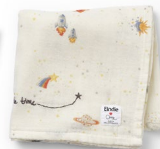
Playground Spaceland 30350153499NA*