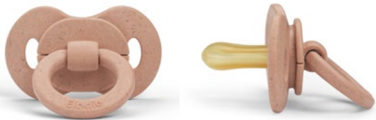
Blushing Pink 30115107151NA Timeless

Say hello to what we call the next generation of sustainable soothers. The natural look and feel of these beauties are achieved by mixing plant-based bamboo fibres with traditional pp-plastic. By using fast growing and renewable bamboo as a resource, we reduce our environmental impact and help you reduce the use of plastic in everyday life.