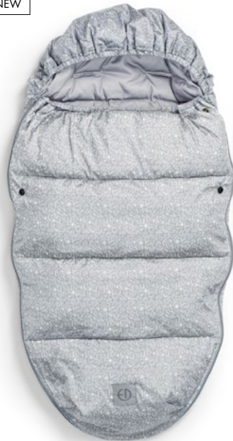
Monkey Sunrise** 50515201400NA