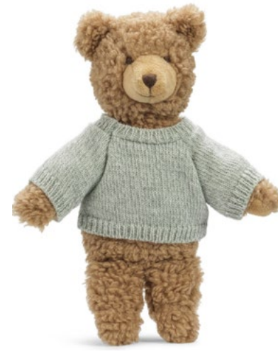
Billy The Bear 70370137858NA