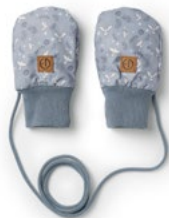
Free Bird 0-12m: 50620202412EC