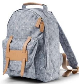
BackPack MINI Free Bird 50880201412NA