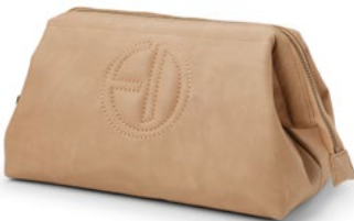
Aviator Brown 70610201198NA