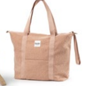
Changing Bag Pink Bouclé Soft Shell 50670200197NA