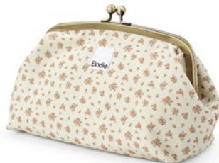
Autumn Rose* 50610139497NA