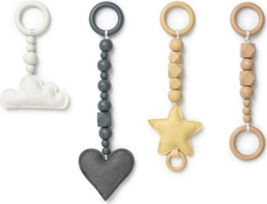
Baby Gym Toys, Multi 70335116300NA (wood frame base sold seperatly)

Size: 19-32 cm Material: wood, filled polyester, padding: 100% polyester ** 100% cotton, Fill: 100% polyester Pcs/Pack: 1