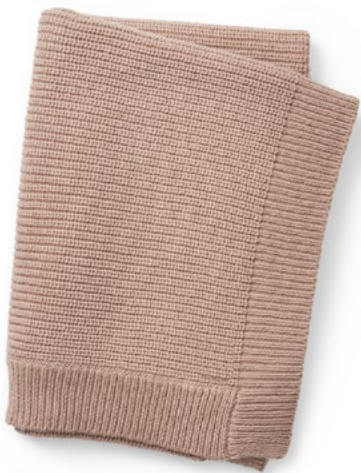
Faded Rose 30300110150NA*

Cellular blankets are ideal for tiny new family members. The small holes in the fabric provide both safety features and make it soft and easy to drape around little bodies. The holes allow for a comfortable flow of air. Due to the breathability of the material, these blankets are also easy to layer and combine with other blankets when needed, depending on the surrounding temperature. It can also work perfectly as a sun or insect screen on the stroller as the holes allow for air circulation.