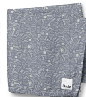
Monkey Sunrise 30350156400NA