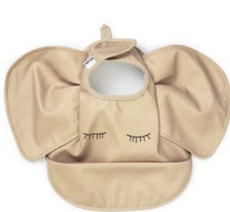
Sweetheart Charlie 30400162655NA