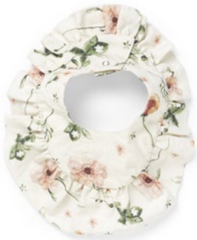
Meadow Blossom 30440136588NA