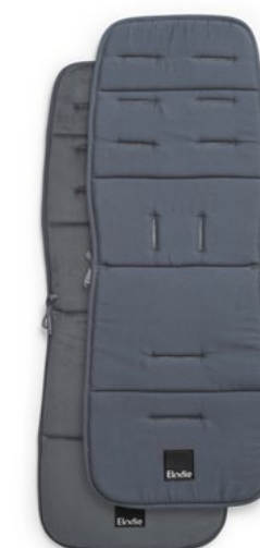
Juniper Blue 50770133192NA Timeless