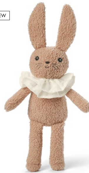
Pink Bouclé Britney 70370200871NA