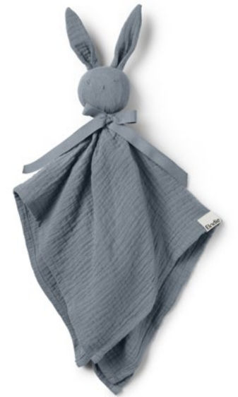
Blue 70340120190NA Timeless