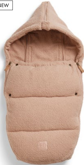
Pink Bouclé 50512201197NA