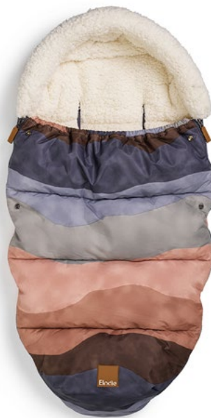
Winter Sunset* 50500128526NA Recycled Material