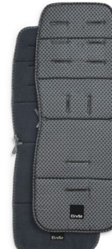
Turquoise Nouveau 50770139507NA