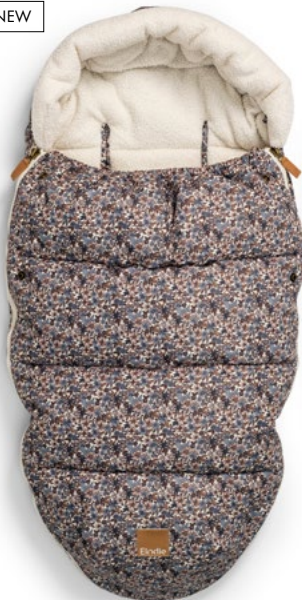
Blue Garden 50500203410NA Recycled Material