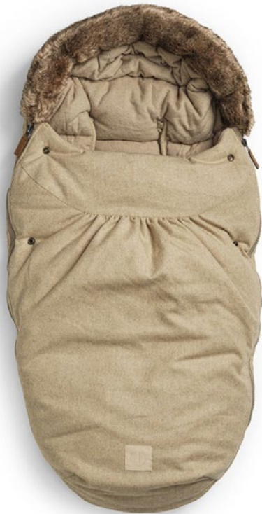
Pure Khaki 50500135116NA