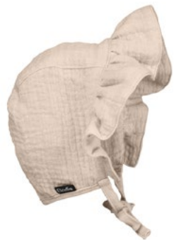
Blushing Pink 0-3m: 50585106151DA 3-6m: 50585106151DB 6-12m: 50585106151DD