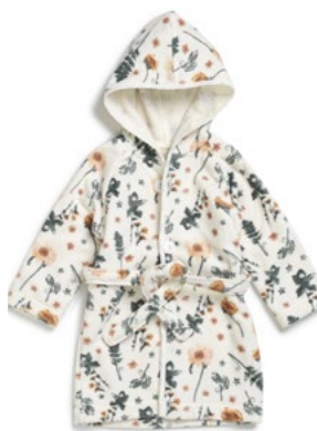
Meadow Blossom 70665102588EF