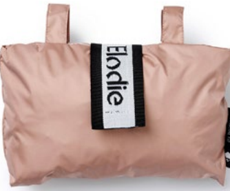
Faded Rose 50700133150NA Timeless