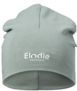
Pebble Green 0-6m: 50560134193DC 6-12m: 50560134193DD 1-2y: 50560134193DE 2-3y: 50560134193DF