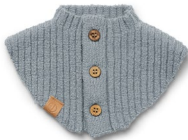
Sunrise Blue 30490201196NA