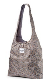
Changing Bag Blue Garden 50670206410NA