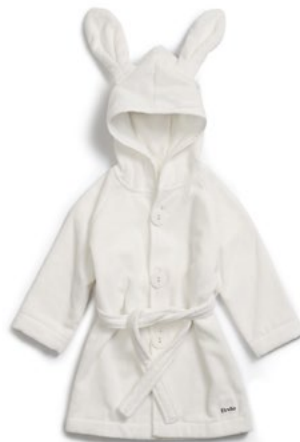
Vanilla White 70665105102EF