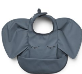
Humble Hugo 30400146642NA Timeless