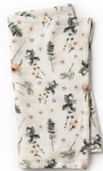
Meadow Blossom 30350146588NA