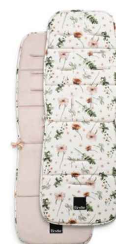
Meadow Blossom 50770143588NA