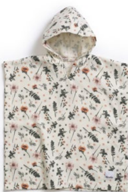
Meadow Blossom 70655102588NA