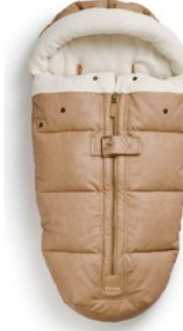
Footmuff Aviator Brown 50500204198NA