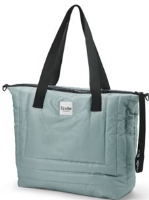
Pebble Green Quilted 50670157193NA