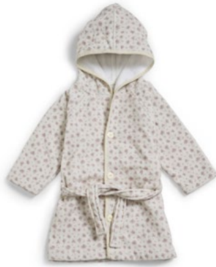
Autumn Rose 70665109497NA