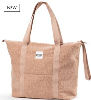
Pink Bouclé Soft Shell 50670200197NA