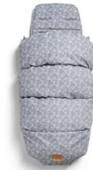
Convertible Footmuff Free Bird 50505200412NA