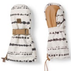
Tidemark Drops* 1-3y: 50620137496EF