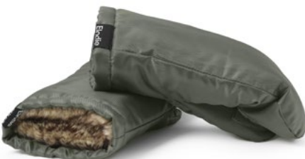
Rebel Green 50620557186NA Timeless