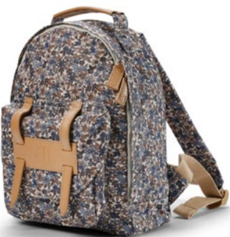
Blue Garden 50880200410NA