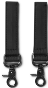
Stroller Loops Black 50670150120NA

Size: one size Material: 100% polyester + metal Care: Surface dabbing Pcs/Pack: 1