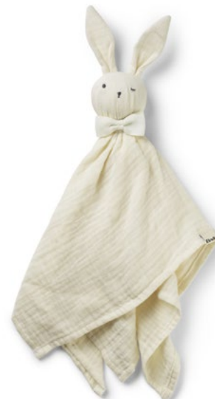
Bonnie 70340124102NA Timeless