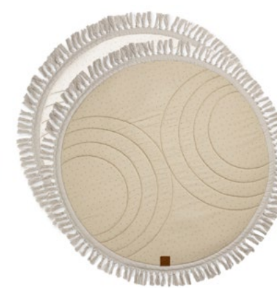
Northern Star Khaki 70830127506NA