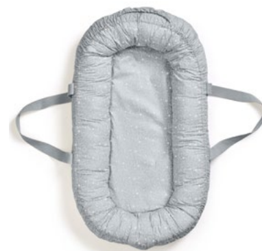
Monkey Sunrise 70225104400NA

Size: Length 78cm, Width 48 cm, height 16 cm Material: Shell: 100% cotton, Fill: 100% polyester, OEKO-Tex 100 Care: Machine wash Pcs/Pack: 1