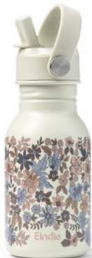
Water Bottle Blue Garden 60258200410NA