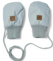
Pebble Green 0-12m: 50620135193EC