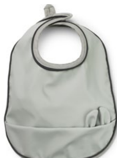
Mineral Green 30400139184NA Timeless