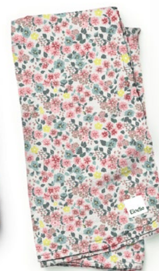
Floating Flowers 30350154498NA*