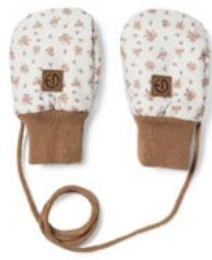
Autumn Rose* 0-12m: 50620132497EC