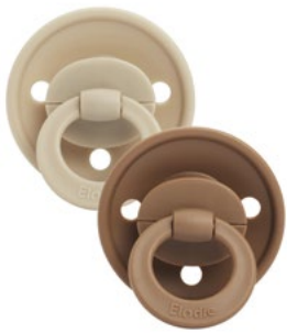
Pure Khaki 30102105116NA