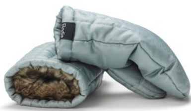
Pebble Green 50620559193NA