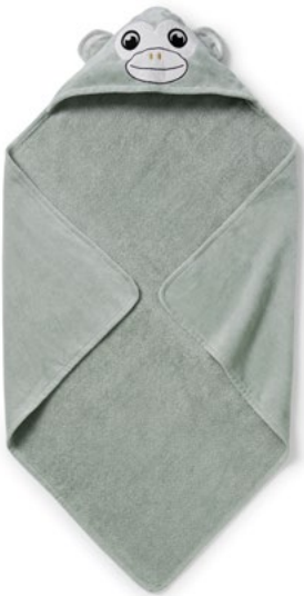
Pebble Green 70660140193NA

Size: 80x80 cm Material: 100% OEKO-TEX® certified cotton Care: 40°C machine wash Pcs/Pack: 3