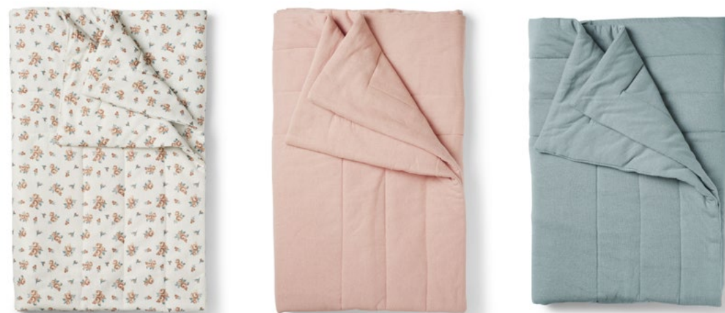
Autumn Rose 30325104497NA

Size: 100 x 100 cm Material: Shell fabric: 100% Cotton, Padding: 100% Polyester Care: 40 °C machine wash, do not tumble dry Pcs/Pack: 3