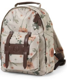
Meadow Blossom 50880135588NA