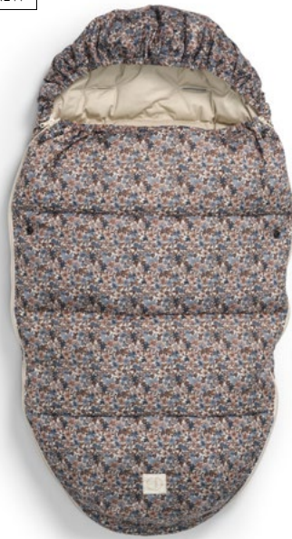
Blue Garden** 50515200410NA