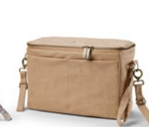
Organizer Aviator Brown 50670204198NA