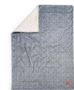
Pearl Velvet Blanket Free Bird 30320201412NA