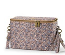
Organizer Blue Garden 50670202410NA