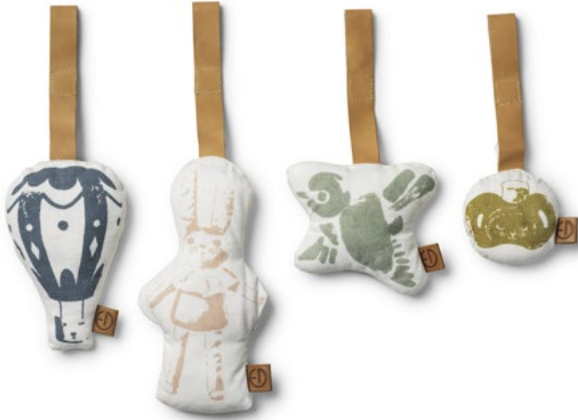
**Baby Gym Toys 70335112300NA (wood frame base sold seperatly)