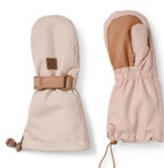
Blushing Pink 1-3y: 50620133151EF