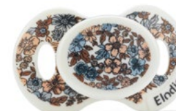
Blue Garden 30110201410NA