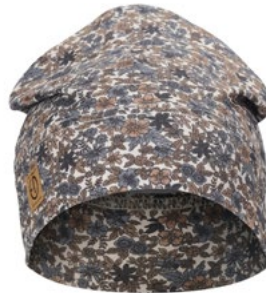
Blue Garden 0-6m: 50570200410DC 6-12m: 50570200410DD 1-2y: 50570200410DE 2-3y: 50570200410DF