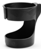
Cup Holder 80800136120NA