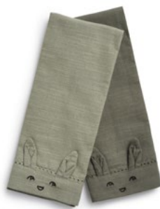
Mineral Green 60285104184NA