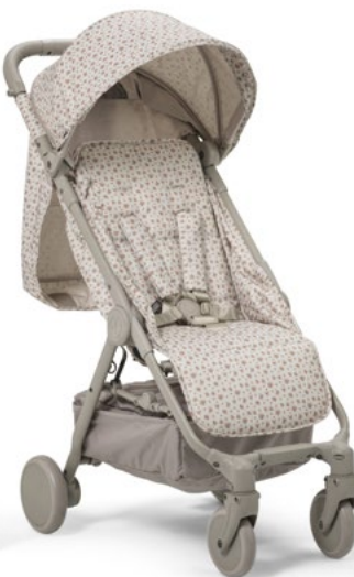
Autumn Rose 80820122497NA