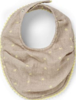
Lemon Sprinkles 30440135504NA