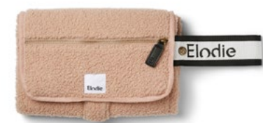
Pink Bouclé 50675200197NA