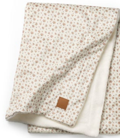
Autumn Rose 30320141497NA