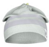
Winter Beanie Utility Green 0-6m: 50530204199DC 6-12m: 50530204199DD 1-2y: 50530204199DE 2-3y: 50530204199DF 3-100yr: 50530204199DG