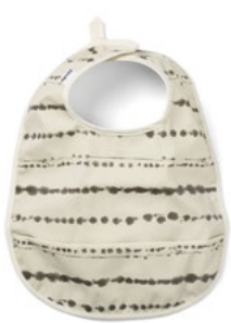
Tidemark Drops 30400171496NA