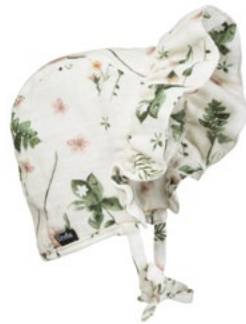
Meadow Blossom 0-3m: 50585107588DA 3-6m: 50585107588DB 6-12m: 50585107588DD