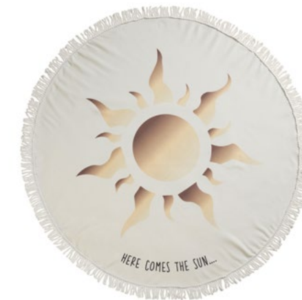
Picnic blanket 70327100866NA

Size: Diameter 120 cm Material: 100% OEKO-TEX® certified cotton, 100% polyester Care: 40°C machine wash Pcs/Pack: 2