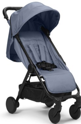
Tender Blue 80820134190NA