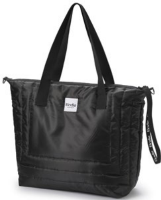
Black Quilted 50670155120NA