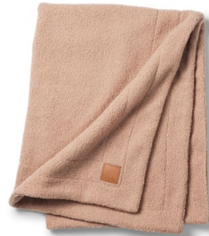
Pink Bouclé 30320202197NA