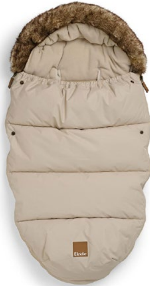
Pure Khaki 50500140116NA Recycled Material