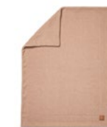
Pearl Velvet Blanket Pink Bouclé 30320202197NA