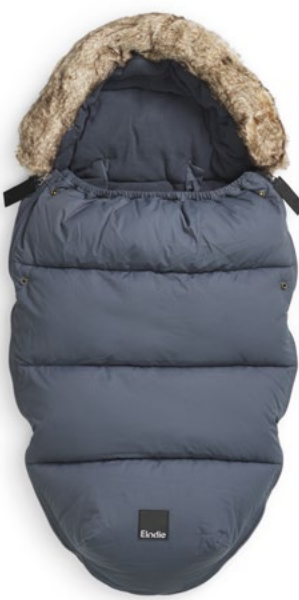
Juniper Blue 50500138192NA Recycled Material Timeless