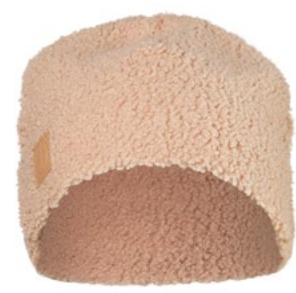
Pink Bouclé 0-6m: 50570202197DC 6-12m: 50570202197DD 1-2y: 50570202197DE 2-3y: 50570202197DF