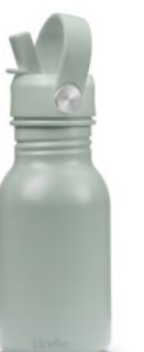
Pebble Green 60258109193NA