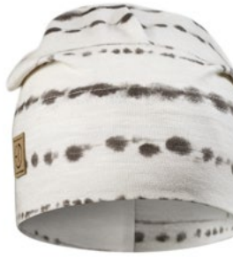
Tidemark Drops* 0-6m: 50570104496DC 6-12m: 50570104496DD 1-2y: 50570104496DE 2-3y: 50570104496DF