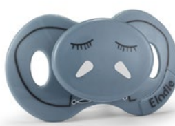
Humble Hugo 30110116642NA