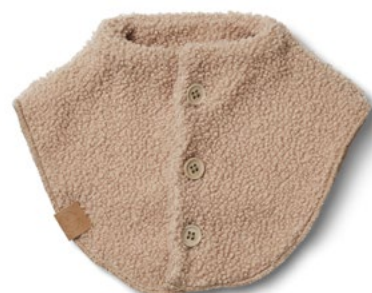
Pink Bouclé 30490202197NA