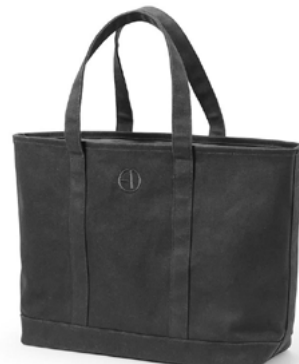
Black Tote 50673101120NA