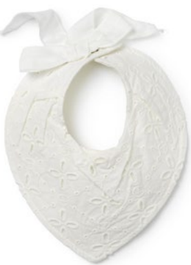
Embroidery Anglais 30440131103NA Timeless