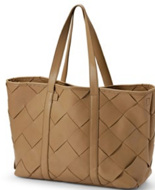
Caramel Brown Braided Leather 50670158139NA