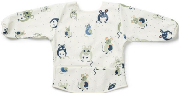
Forest Mouse* 30410108587NA

Keeping your little one dry at all times can be a challenge. These fabulous fabrics can do just that, and do it with grace! No more spit or dribble on that carefully selected outfit. They feature double layers of OEKO-TEX® certified and waterproof soft cotton. Two press studs in the neck create two different sizes. Easy to clean, easy to fasten, hard to be without.