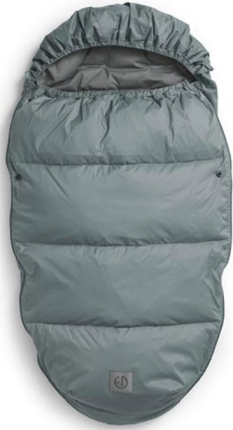
Deco Turquoise* 50515121181NA