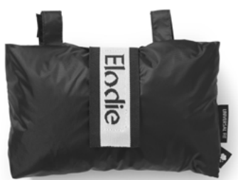
Brilliant Black 50700132122NA Timeless