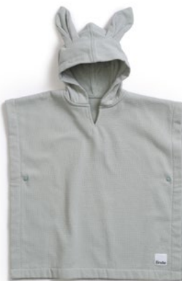
Mineral Green 70655103184NA Timeless