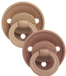
Soft Terracotta 30102104157NA