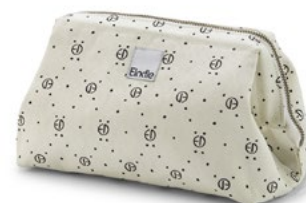
Monogram Print 50610125548NA Timeless