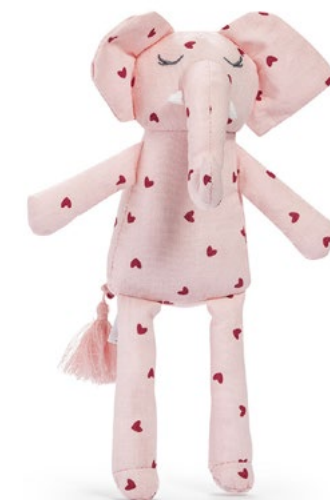
Sweetheart Charlie 70370135655NA