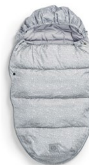
Light Down Footmuff Monkey Sunrise 50515201400NA