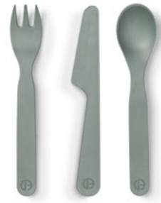
Pebble Green 60265105193NA