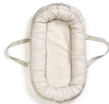
Vanilla White 70225101102NA