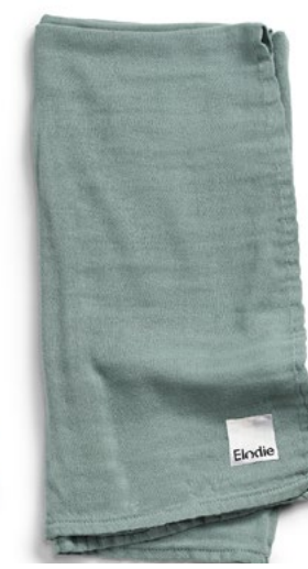
Mineral Green 30350131184NA Timeless