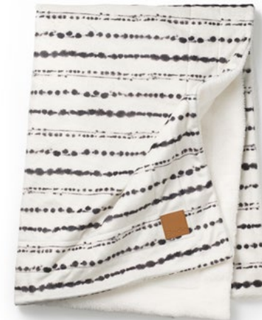
Tidemark Drops 30320143496NA