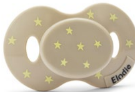
Lemon Sprinkles 30100147504NA