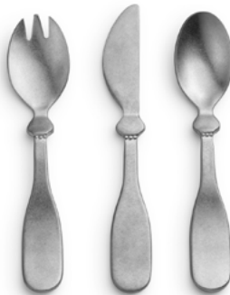
Antique Silver 60265103350NA Timeless