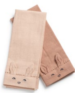
Faded Rose / Powder Pink 60285101150NA Timeless