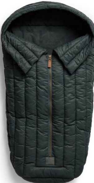
Minnesota Green 50500144189NA