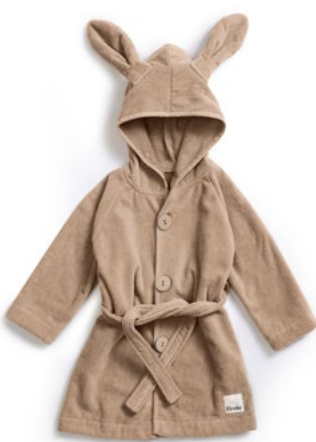
Blushing Pink 70665100151EF