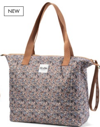
Blue Garden Soft Shell 50670201410NA