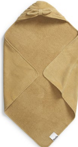
Gold Bow 70660128172NA Timeless