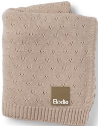
Blushing Pink 30326002151NA