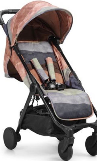
Winter Sunset 80820119526NA