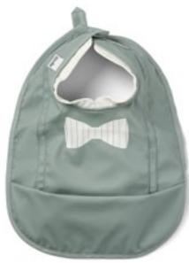
Pebble Green 30400172193NA