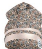
Winter Beanie Blue Garden 0-6m: 50530201410DC 6-12m: 50530201410DD 1-2y: 50530201410DE 2-3y: 50530201410DF 3-100yr: 50530201410DG