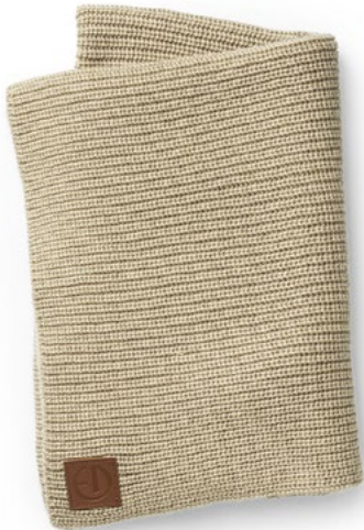
Pure Khaki 30300109116NA* Timeles