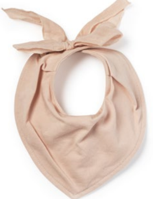
Powder Pink 30440130152NA Timeless