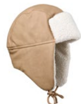
Winter Cap Aviator Brown 6-12m: 50540200198DD 1-2y: 50540200198DE 2-3y: 50540200198DF 3-100yr: 50540200198DG