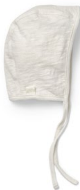
Vanilla White 0-3m: 50595103102DA 3-6m: 50595103102DB