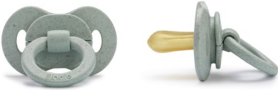
Mineral Green 30115104184NA Timeless