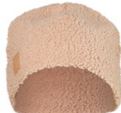
Autumn Beanie Pink Bouclé 0-6m: 50570202197DC 6-12m: 50570202197DD 1-2y: 50570202197DE 2-3y: 50570202197DF