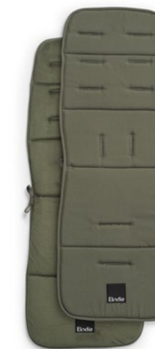
Rebel Green 50770135186NA Timeless