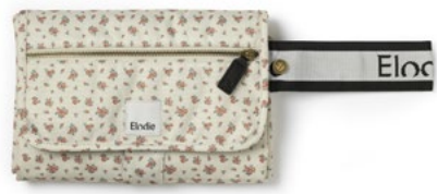
Autumn Rose 50675123497NA