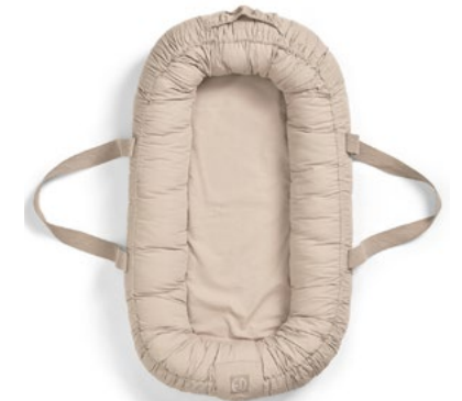
Blushing Pink 70225102151NA