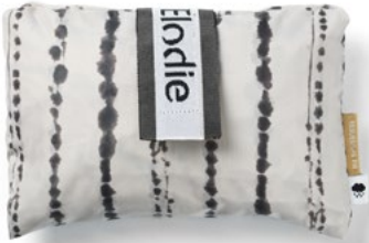
Tidemark Drops 50700138496NA

Size: The pouch measures 26 x 13 x 6 cm Material: PU-coated Polyester Extra: Can be wiped clean or machine washed Pcs/Pack: 2