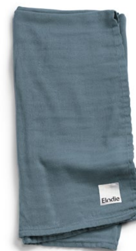
Tender Blue 30350144190NA Timeless