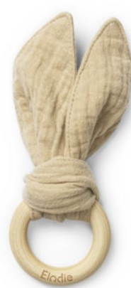
Pure Khaki 70345102116NA