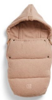
Carseat Footmuff Pink Bouclé 50512201197NA