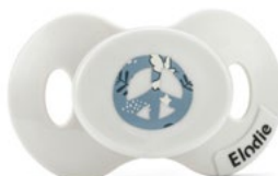
Small People For Peace 30110200870NA