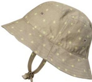
Lemon Sprinkle 0-6m: 50590101504DC 6-12m: 50590101504DD 1-2y: 50590101504DE 2-3y: 50590101504DF