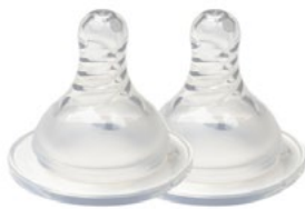
Silicon teats 0m+ 60252104002PA 6m+ 60252104002PC