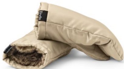
Pure Khaki 50620556116NA Timeless