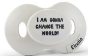
Change The World 30100135715NA

You don't have to be able to speak to express yourself! In our wide selection of pacifiers for newborns you can find a style that fits every mood and every personality. Playful, unexpected or just plain pretty, your new favourite is guaranteed to be here. These high-quality pacifiers feature an orthodontic suction teat to help prevent dental irregularities in the future, and full instructions on how to use are included with the packaging.