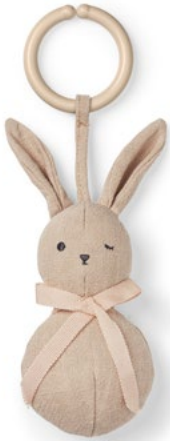
Loving Lily 50825001863NA