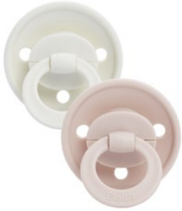
Powder Pink 30106101152NA