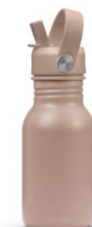
Blushing Pink 60258101151NA