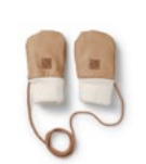
Mittens Aviator Brown 0-12m: 50620204198EC