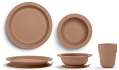
Soft Terracotta 60262002157NA