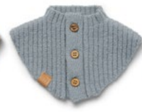
Warming Collar Sunrise Blue 30490201196NA