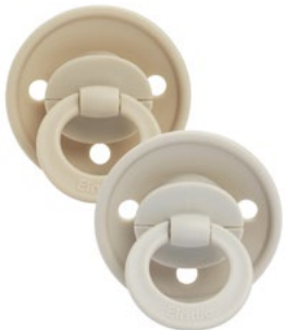
Pure Khaki 30106105116NA