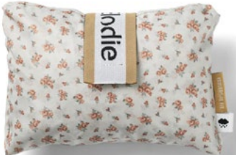
Autumn Rose 50700139497NA