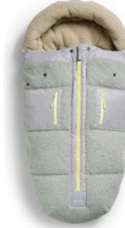
Footmuff Utility Green 50500205199NA