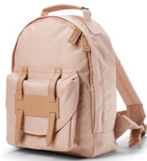
BackPack MINI Blushing Pink 50880203151NA