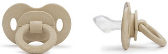
Pure Khaki 30115105116NA Timeless