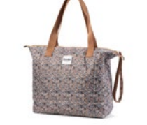
Changing Bag Blue Garden Soft Shell 50670201410NA