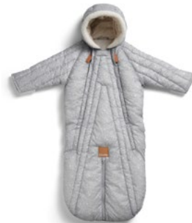
Baby Overall Monkey Sunrise 0-6m: 50510201400DC 6-12m: 50510201400DD