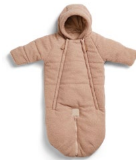
Baby Overall Pink Bouclé 0-6m: 50510200197DC 6-12m: 50510200197DD

Elodie's Autumn / Winter 2023 collection has a message to send. It is designed with prints and patterns filled with hope. Sent with the voice of a generation that has just arrived in this world, but already knows what it wants from it. Peace and Happiness. The collection feature new Footmuffs of various kinds, Changing Bags, Headwear, Mittens and much more. And of course, new clips and pacifiers for true little pacifists who want to make a statement. The colour pallet is cantered around Pink and Blue but updated and attuned for 2023. We love flowery prints and our latest - "Blue Garden" - is filled with little tone-in-tone anemones. "Free Bird" is the defining print of the collection, where olive branches and white doves mingle with the well-known peace sign. A collection filled with structured, tactile materials and carefully selected little details. But most importantly, filled with a message that can never be repeated enough times. Small people for peace!