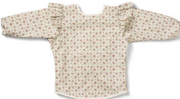
Autumn Rose 30410112497NA

Size: Suitable for ages 1 to 3 years. Material: PU-treated Polyester, 100% free from PVC and phtalates. Care: 40°C machine wash Pcs/Pack: 5