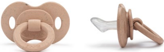
Blushing Pink 30115101151NA Timeless