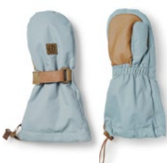
Pebble Green 1-3y: 50620135193EF

These comfortable, elastic wristbands keep Elodie mittens from getting lost. Simply attach the ribbon to the D-ring inside the mitten and thread the cuff over your child's wrist to ensure they don't end up on the ground when they come off. Suitable for children aged 1 to 3 years.