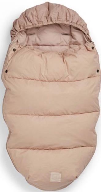
Blushing Pink 50515122151NA