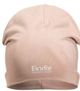
Powder Pink 0-6m: 50560128152DC 6-12m: 50560128152DD 1-2y: 50560128152DE 2-3y: 50560128152DF Timeless