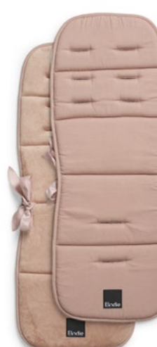
Faded Rose 50770128150NA Timeless