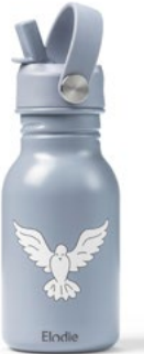
Free Bird 60258201868NA