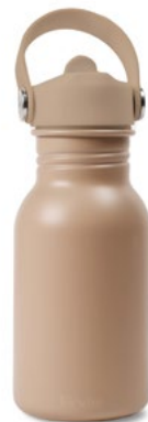
Water Bottle Blushing Pink 60258101151NA