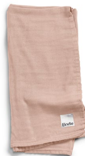
Powder Pink 30350148152NA Timeless