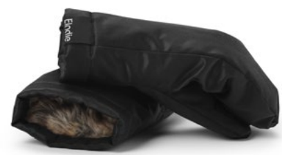
Black Edition 50620125120NA Timeless