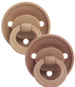
Soft Terracotta 30102101157NA