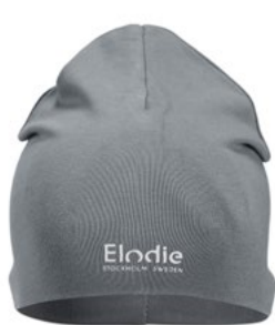
Tender Blue 0-6m: 50560121190DC 6-12m: 50560121190DD 1-2y: 50560121190DE 2-3y: 50560121190DF Timeless