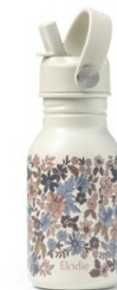
Blue Garden 60258200410NA