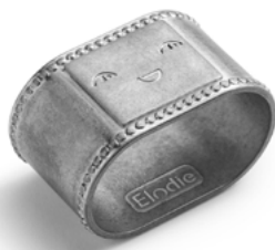
Antique Silver 60270103350NA Timeless