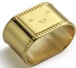
Gold 60270102370NA Timeless

Sustainable and re-usable quality napkins for babies and toddlers is a nice way to reduce your family’s use of nature’s limited resources. No need for disposable paper napkins. The vintage linen-look of these napkins combine softness with a characteristic texture in the cotton material. The cute design details are fun for children, and decorative hemstitches give them a hint of luxury and sophistication. The understated colours make the napkins easy to match with any table setting.