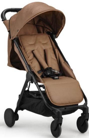
Caramel Brown 80820117139NA