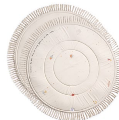
Playground Spaceland* 70830128499NA

Size: Diameter 120 cm Material: 100% OEKO-TEX® certified cotton, 100% polyester padding Care: 40°C machine wash Pcs/Pack: 2