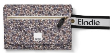
Blue Garden 50675202410NA