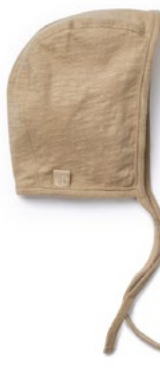
Pure Khaki 0-3m: 50595102116DA 3-6m: 50595102116DB