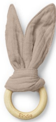
Blushing Pink 70345101151NA