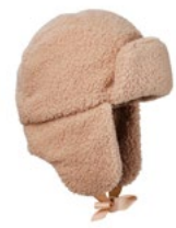
Winter Cap Pink Bouclé 6-12m: 50540201197DD 1-2y: 50540201197DE 2-3y: 50540201197DF 3-100yr: 50540201197DG