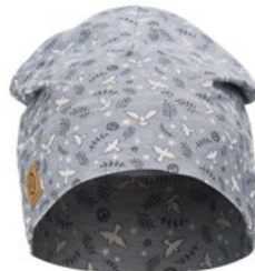
Autumn Beanie Free Bird 0-6m: 50570201412DC 6-12m: 50570201412DD 1-2y: 50570201412DE 2-3y: 50570201412DF