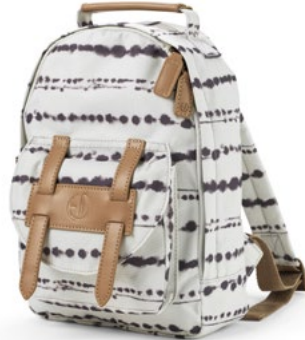
Tidemark Drops* 50880146496NA