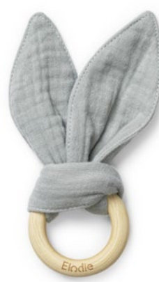
Mineral Green 70345100184NA