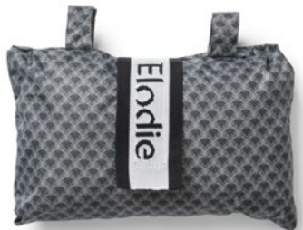
Turquoise Nouveau 50700136507NA