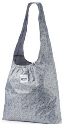
Free Bird 50670210412NA