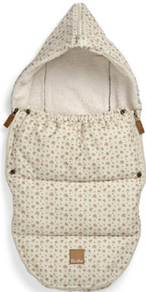
Autumn Rose 50512101497NA