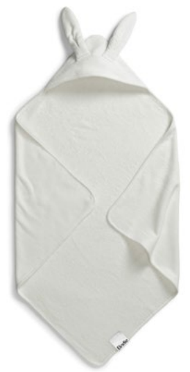
Vanilla White Bunny 70660126102NA Timeless