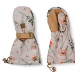
Meadow Blossom* 1-3y: 50620134588EF