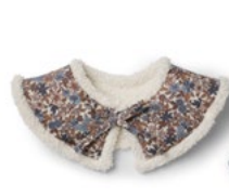
Warming Collar Blue Garden 30490200410NA