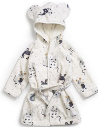
Forest Mouse 70665106587EF