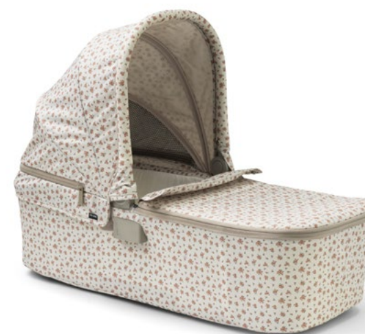
Autumn Rose 80820123497NA