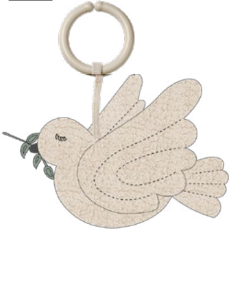
Free Bird 50825200868NA