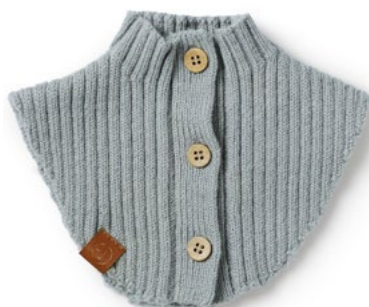
Pebble Green 30490102193NA