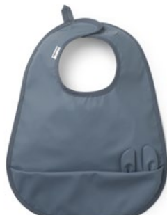
Tender Blue Bunny 30400160190NA* Timeless