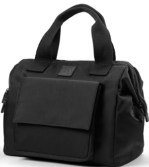
Black Wide Frame 50670154120NA