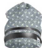
Winter Beanie Free Bird 0-6m: 50530200412DC 6-12m: 50530200412DD 1-2y: 50530200412DE 2-3y: 50530200412DF 3-100yr: 50530200412DG