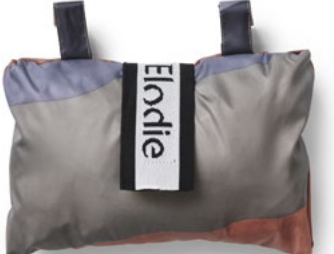
Winter Sunset 50700137526NA