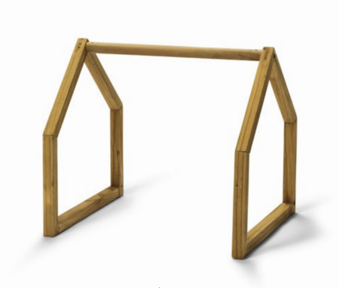
Baby Gym 70335111148NA (Base)