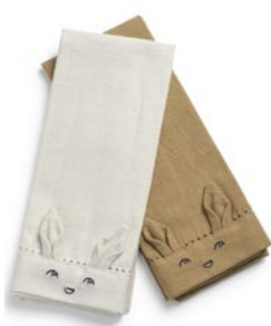
Lily White / Warm sand 60285103110NA Timeless