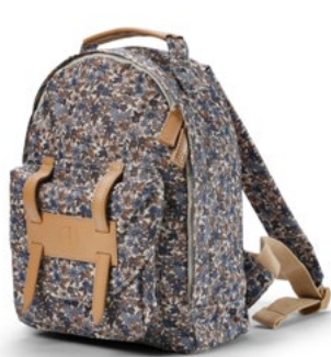
BackPack MINI Blue Garden 50880200410NA

The end of Summer is drawing near, and with that the excitement of going back to school. Whether it's kindergarten, pre-school or elementary school, we've got some great gear lined up for your family. The star of our back to school campaigns are always the best little Back Pack you can find, and this year we've got four new styles to choose from. With matching Stainless Steel Water Bottles and warming Autumn Beanies as the addition, you are free to create great looking combinations for those exciting days to come.