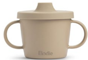
Pure Khaki 60254105116NA