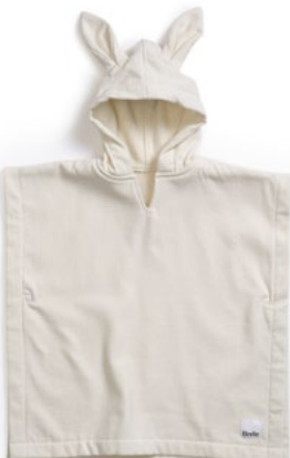
Vanilla White 70655106102NA Timeless