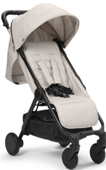
Moonshell 80820130112NA Timeless