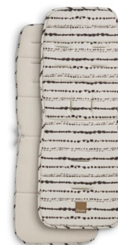
Tidemark Drops 50770141496NA

Size: 85 x 32 cm Material: Various, consult website for details, Materials NEWS: 80/20 linen/cotton blend Care: Various, consult website for details Pcs/Pack: 3