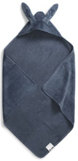
Tender Blue Bunny 70660130190NA Timeless