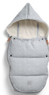
Carseat Footmuff Monkey Sunrise 50512202400NA