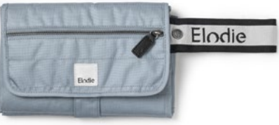
Pebble Green 50675124193NA