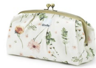
Meadow Blossom 50610138588NA