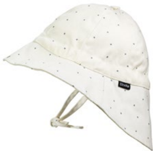
Tender Blue Drew 6-12m: 50580131589DD 1-2y: 50580131589DE 2-3y: 50580131589DF