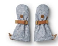
Mittens Free Bird 1-3y: 50620202412EF