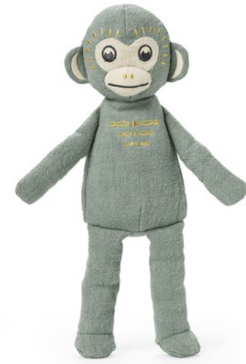
Playful Pebble 70370138864NA