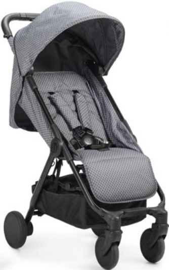
Turquoise Nouveau 80820118507NA