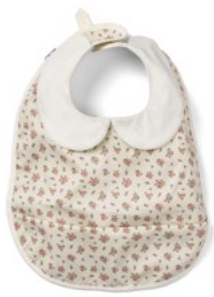
Autumn Rose 30400170497NA