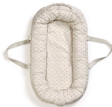
Autumn Rose 70225106497NA