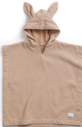
Blushing Pink 70655100151NA Timeless