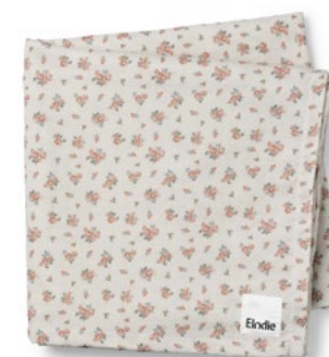
Autumn Rose 30350155497NA