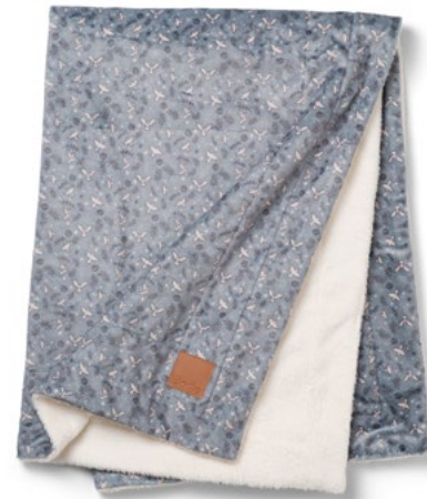
Free Bird 30320201412NA