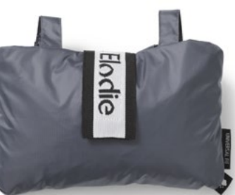
Juniper Blue 50700129192NA Timeless