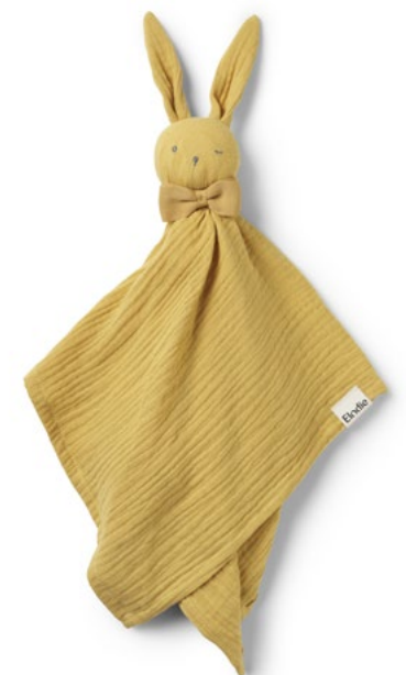
Goldie 70340121172NA Timeless