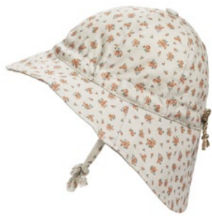
Autumn Rose 6-12m: 50580137497DD 1-2y: 50580137497DE 2-3y: 50580137497DF

Size: Four sizes, 0-6m, 6-12m, 1-2y Material: 97% Cotton, 3 % Elastane Care: 40°C machine wash Extra: SPF 30 Pcs/Pack: 2