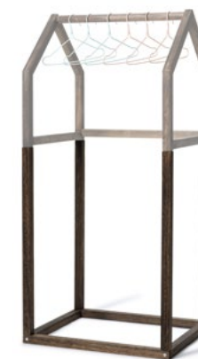
Hanging Rack, Dark Wood 70335117149NA

Size: Height: 119 cm / Width: 55 cm / Depth: 45 cm Weight: 2,7 kg Material: Wood Safety Standard: This product is not a toy and therefore does not comply with the European standard EN71 Pcs/Pack: 1