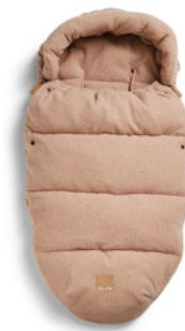
Footmuff Pink Bouclé 50500201197NA