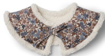
Blue Garden 30490200410NA