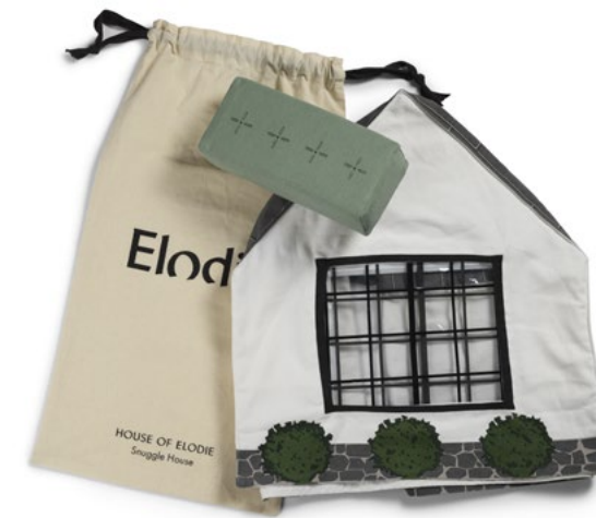
70335113300NA (Textile cover for baby gym)

Size: Height: 49 cm / Width: 55 cm / Depth: 45 cm Material: 100% Cotton Safety Standard: EN-71 Pcs/Pack: 1