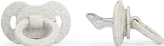
Vanilla White 30115103102NA Timeless