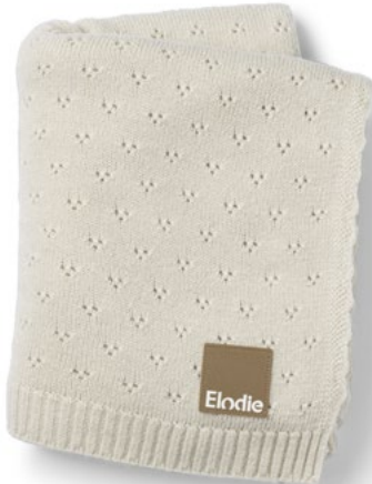
Creamy White 30326001113NA

Size: 75x100 cm Material: Acrylic 100% Care: 30°C machine wash Pcs/Pack: 3