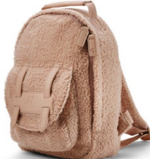
BackPack MINI Pink Bouclé 50880202197NA