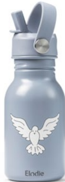
Water Bottle Free Bird 60258201868NA