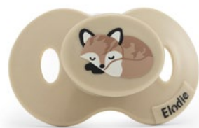
Florian The Fox 30100146654NA