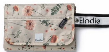
Meadow Blossom 50675120588NA