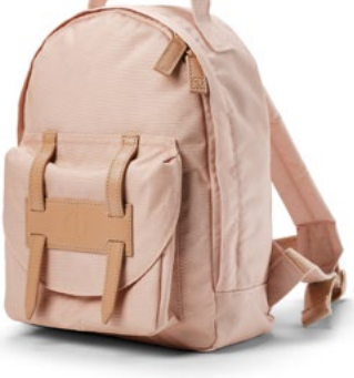
Blushing Pink 50880203151NA