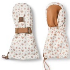
Autumn Rose* 1-3y: 50620132497EF