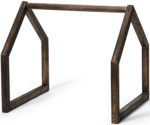
Baby Gym, Dark Wood 70335115149NA (Base)

Size: Height: 49 cm / Width: 55 cm / Depth: 45 cm Weight: 1,4 kg Material: Wood Safety Standard: EN-71 Extra: Comes with a construction manual Pcs/Pack: 1