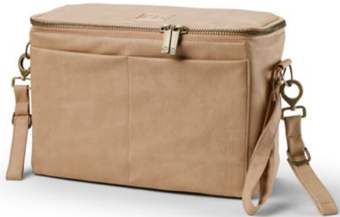
Aviator Brown 50670204198NA