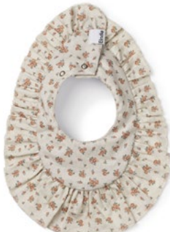
Autumn Rose 30440139497NA