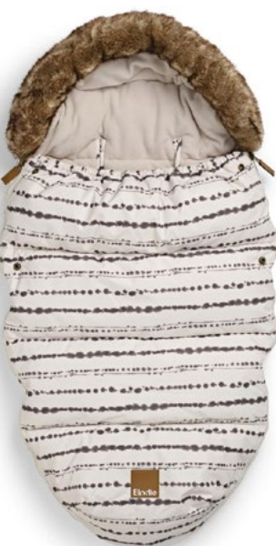
Tidemark Drops 50500146496NA Recycled Material