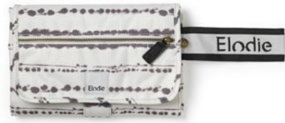
Tidemark Drops 50675126496NA