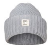
Wool Beanie Sunrise Blue 0-6m: 50565200196DC 6-12m: 50565200196DD 1-2y: 50565200196DE 2-3y: 50565200196DF 3-100yr: 50565200196DG