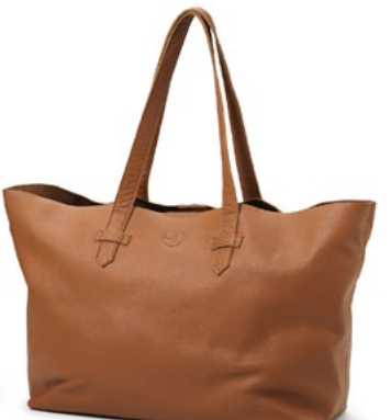
Chestnut Leather Genuine Leather 50670139142NA