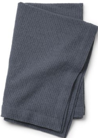
Tender Blue 30385103190NA Timeless