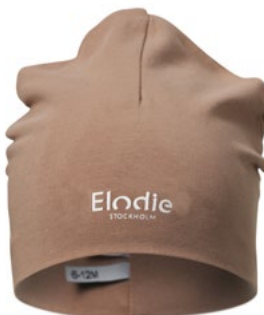
Soft Terracotta 0-6m: 50560133157DC 6-12m: 50560133157DD 1-2y: 50560133157DE 2-3y: 50560133157DF