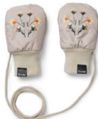
Meadow Blossom* 0-12m: 50620130652EC