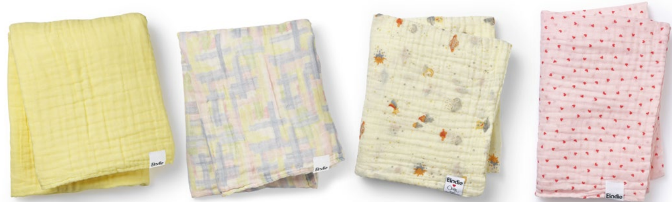
Sunny Day Yellow 70365109168NA

Size: 120x120 cm Material: 100% Cotton, OEKO-TEX® certified Cotton Care: 30 °C machine wash Pcs/Pack: 3