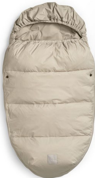
Lily White 50515119110NA