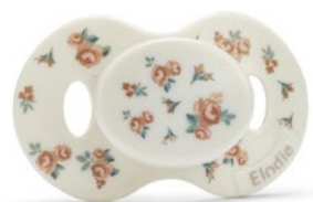
Autumn Rose 30100152497NA