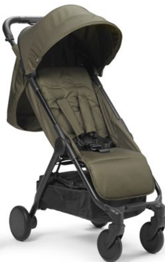
Rebel Green 80820133186NA