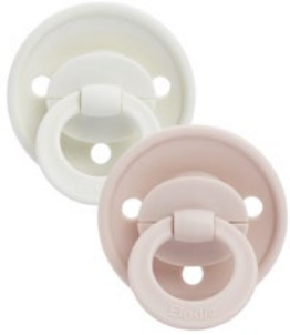
Powder Pink 30106106196NA