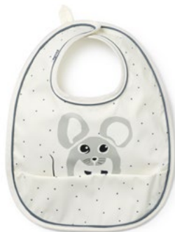
Forest Mouse Max 30400157650NA