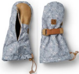
Free Bird 1-3y: 50620202412EF