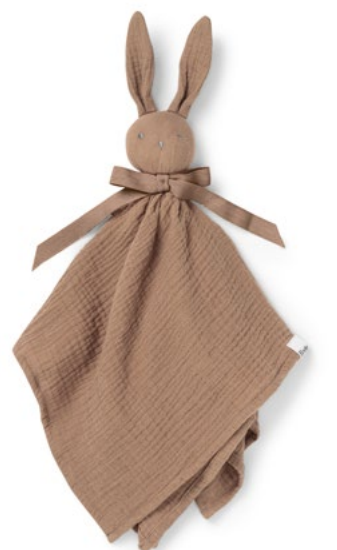
Belle 70340126152NA Timeless