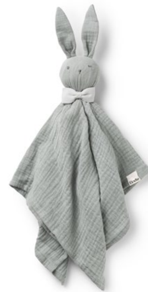
Bo 70340118184NA Timeless

Size: 50 cm height Material: 100% Cotton Muslin Safety Standard: EN 71 Care: Machine wash cold, with mild detergent. Air dry Pcs/Pack: 3