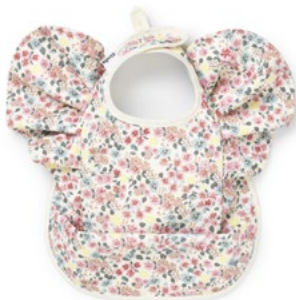
Floating Flowers 30400167498NA