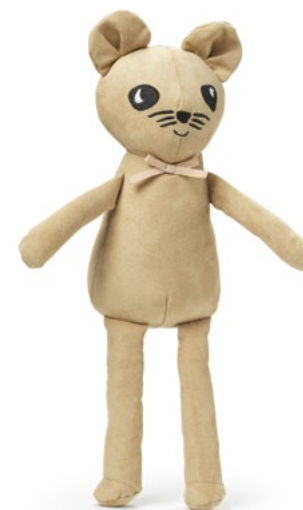
Forest Mouse Max 70370133145NA