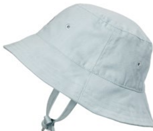
Aqua Turquoise 0-6m: 50590100179DC 6-12m: 50590100179DD 1-2y: 50590100179DE 2-3y: 50590100179DF