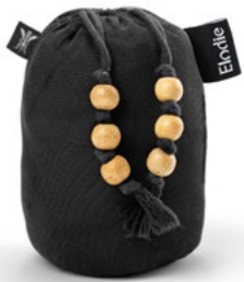
Mosquito Net Black 50240118120NA Timeless

Size: One size fits all Material: 100% Polyester Pcs/Pack: 2