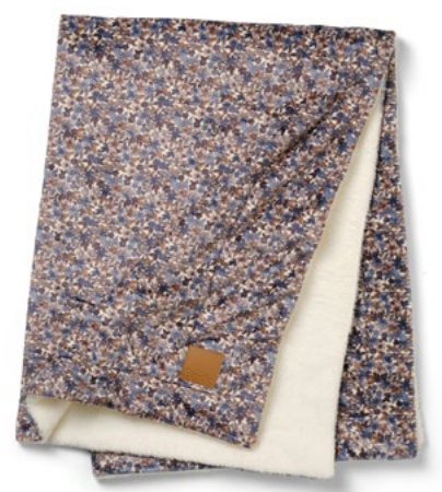
Blue Garden 30320204410NA