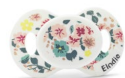
Floating Flowers 30110121498NA