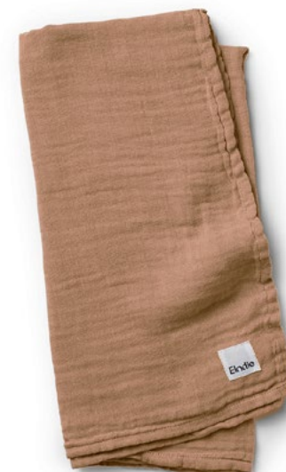
Soft Terracotta 30350150157NA