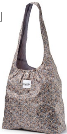
Blue Garden 50670206410NA