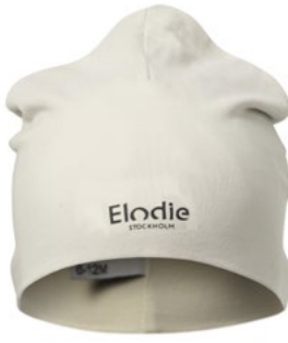
Creamy White 0-6m: 50560132113DC 6-12m: 50560132113DD 1-2y: 50560132113DE 2-3y: 50560132113DF