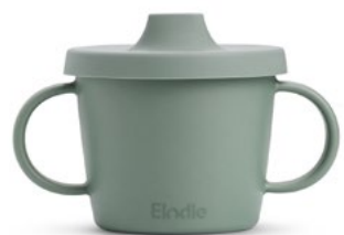
Pebble Green 60254104193NA