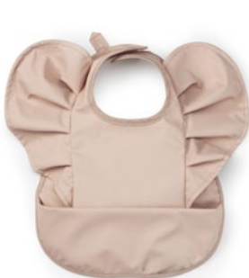
Powder Pink 30400133152NA Timeless