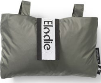
Rebel Green 50700131186NA Timeless