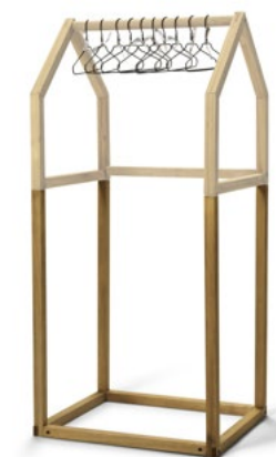
Hanging Rack 70335114148NA