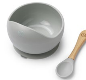
Mineral Green 60245100184NA