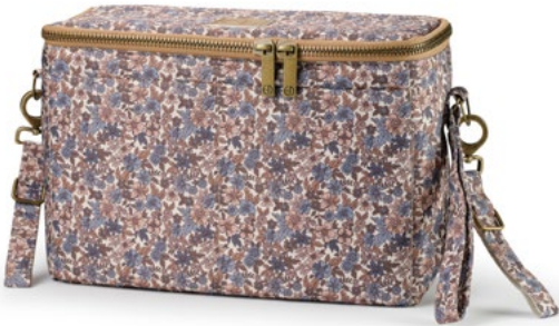
Blue Garden 50670202410NA