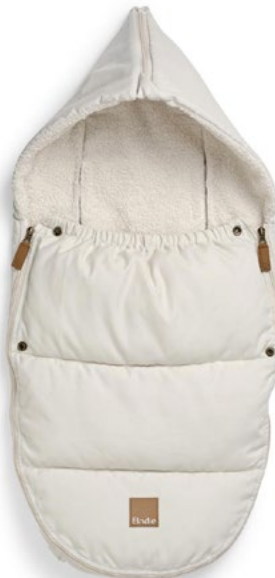
Creamy White 50512102113NA