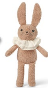
Snuggle Pink Bouclé Britney 70370200871NA