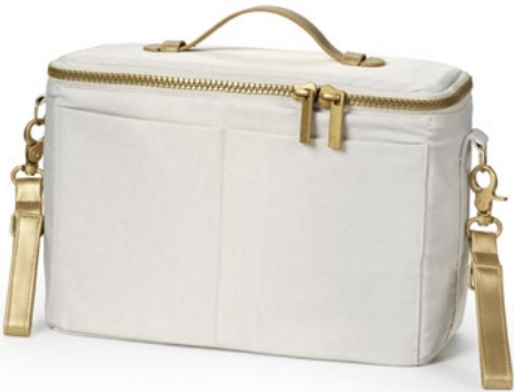
Creamy White 50670171113NA