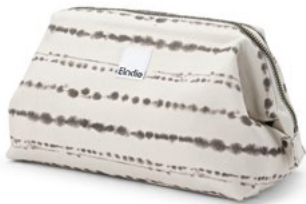
Tidemark Drops 50610142496NA