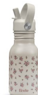
Autumn Rose 60258104497NA