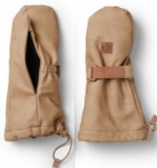
Aviator Brown 1-3y: 50620204198EF