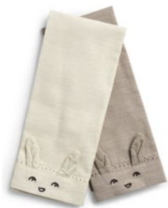
Vanilla White 60285105102NA

Size: Width 45 cm, Height 45 cm Material: 100% OEKO-TEX® certified cotton Care: 40 °C machine wash Pcs/Pack: 3