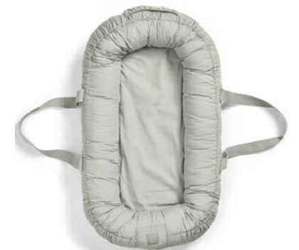
Mineral Green 70225100184NA