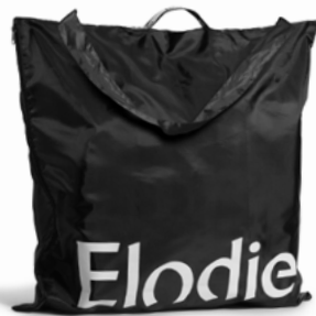
Stroller Carry Bag 80820129120NA