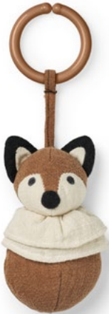
Florian The Fox 50825003654NA