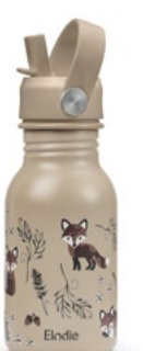
Nordic Woodland 60258105598NA