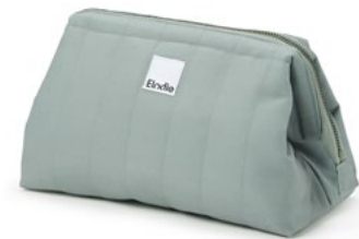
Pebble Green 50610140193NA