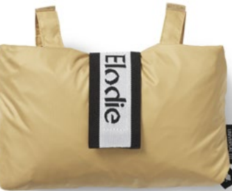
Gold 50700130172NA Timeless