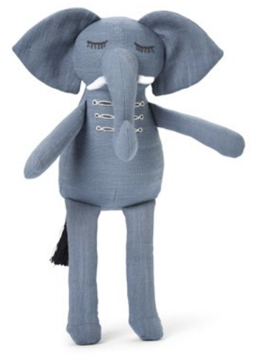
Humble Hugo 70370128642NA