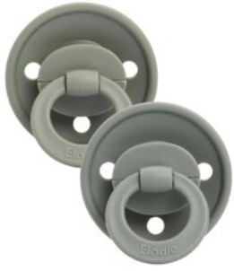
Hazy Jade 30102106185NA

The Binky Bundle is a duo-pack of pacifiers with round teats in either latex or Silicone. They are available in both new-born and +3 month sizes, but most of all – in many colours and shades that perfectly blend with all your other Elodie gear.