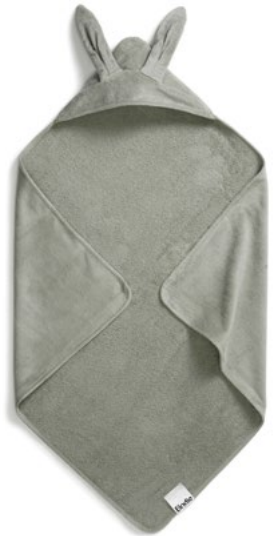
Mineral Green Bunny 70660131184NA Timeless