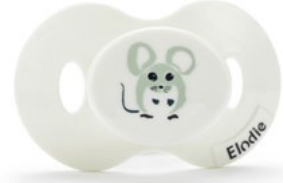
Forest Mouse Max 30100144650NA