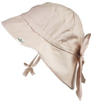
Powder Pink 6-12m: 50580134152DD 1-2y: 50580134152DE 2-3y: 50580134152DF Timeless