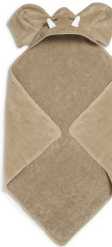
Sweetheart Charlie 70660135655NA