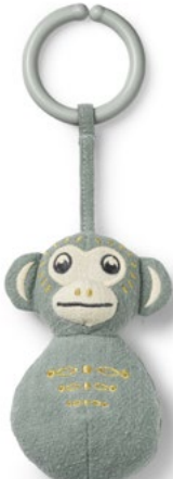
Playful Pebble 50825004864NA

Why settle for function when you can have form as well? Presenting the only mosquito nets on the market with contemporary design features, both on the net and the storage pouch. The thin double layer weave has a universal fit and will keep all flying annoyances safely on the outside. Comes packed in a cute and compact little storage pouch for convenient storage right in your stroller, pram, buggy or pushchair.