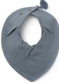
Tender Blue 30440132190NA Timeless