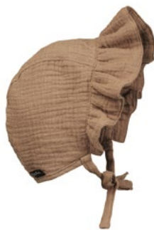
Soft Terracotta 0-3m: 50585108157DA 3-6m: 50585108157DB 6-12m: 50585108157DD