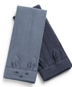
Tender Blue / Juniper Blue 60285102190NA Timeless