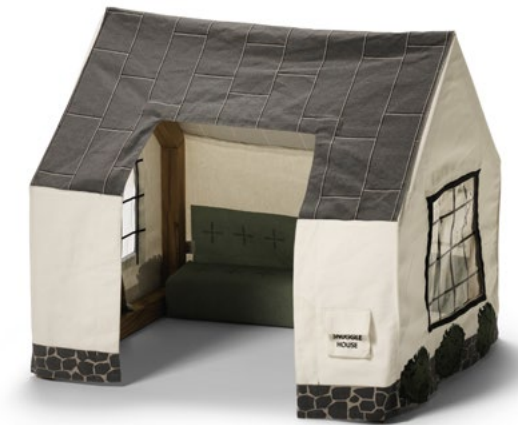
Snuggle House Cover 70335113300NA (Textile cover for baby gym)