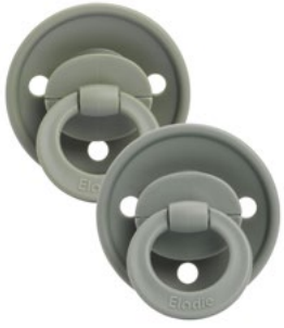
Hazy Jade 30102103185NA