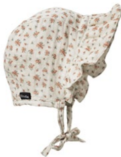
Autumn Rose 0-3m: 50585112497DA 3-6m: 50585112497DB 6-12m: 50585112497DD

Size: 0-12m Material: 100% Cotton Extra: SPF 30 Care: 40°C machine wash Pcs/Pack: 2