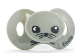
Hazy Jade Max 30110119653NA