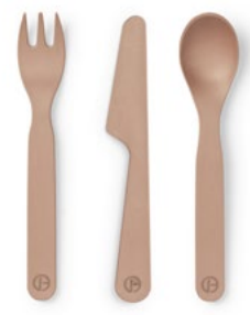
Soft Terracotta 60265107157NA

This sippy cup with handles is perfect for kids learning to eat and drink on their own. The spill-free lid is made with comfortable food-grade silicone. The PLA material of the cup is a Bioplastic made from renewable resources. A sustainable choice and a way for you to reduce your environmental impact. You can find matching PLA dinner sets and cutlery in Elodie’s assortment.