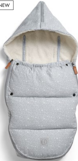
Monkey Sunrise 50512202400NA