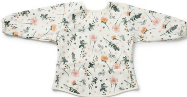
Meadow Blossom* 30410107588NA