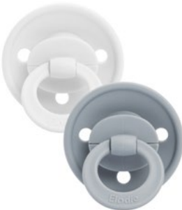
Sunrise Blue 30106103196NA