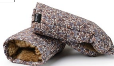
Blue Garden 50620201410NA