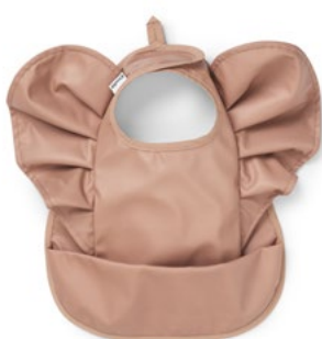
Soft Terracotta 30400164157NA