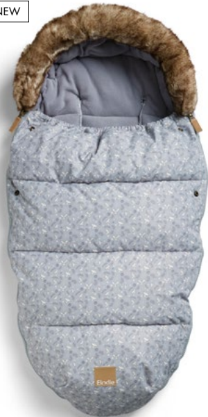
Free Bird 50500202412NA Recycled Material