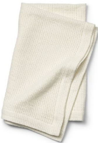
Vanilla White 30385101102NA Timeless