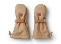
Mittens Aviator Brown 1-3y: 50620204198EF