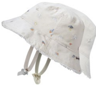
Playground Spaceland 0-6m: 50590104499DC 6-12m: 50590104499DD 1-2y: 50590104499DE 2-3y: 50590104499DF