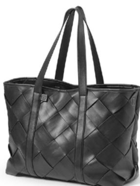
Black Braided Leather 50673104125NA