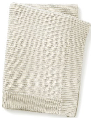
Vanilla White 30300112102NA* Timeless