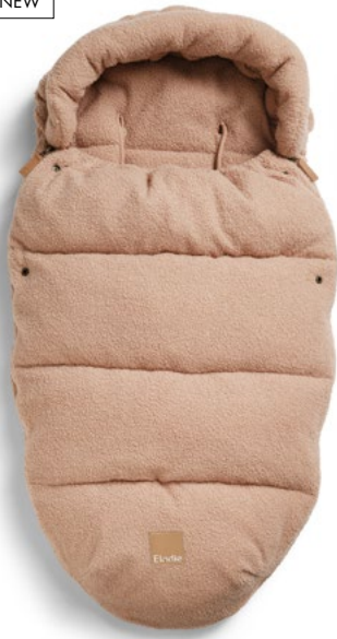
Pink Bouclé 50500201197NA Recycled Material