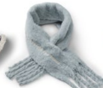
Scarf Sunrise Blue 30525200196NA