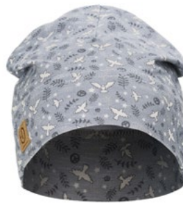
Free Bird 0-6m: 50570201412DC 6-12m: 50570201412DD 1-2y: 50570201412DE 2-3y: 50570201412DF