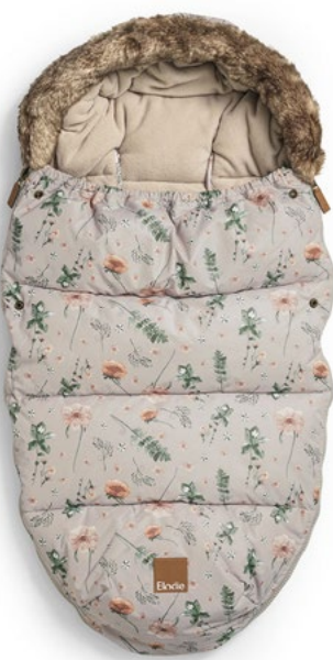
Meadow Blossom 50500131588NA Recycled Material