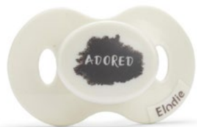
Tidemark Drops 30100154860NA