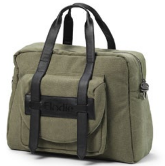
Rebel Green Signature Edition 50670131186NA Timeless