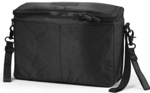
Organizer Black 50670142120NA Timeless