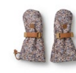
Mittens Blue Garden 1-3y: 50620203410EF