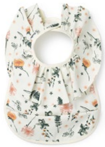
Meadow Blossom 30400155588NA