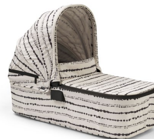
Tidemark Drops 80820124496NA