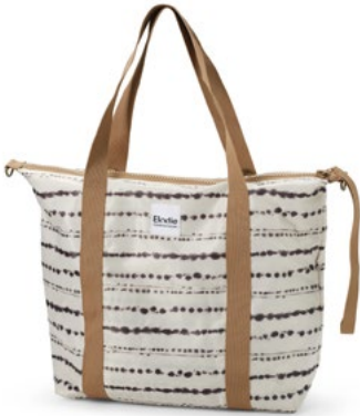
Tidemark Drops Soft Shell 50670153496NA