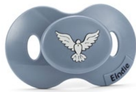
Free Bird 30100200868NA