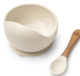
Vanilla White 60245103102NA