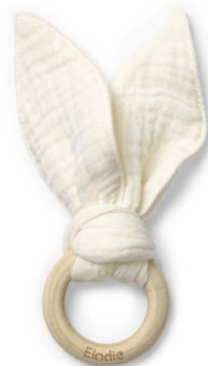
Vanilla White 70345106102NA

Size: Length 16 cm, ring diameter 6 cm Material: 100% cotton muslin, wood Care: Ring: handwash, Fabric: 40°C delicate Pcs/Pack: 5