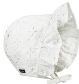
Embroidery Anglaise 0-3m: 50585104103DA 3-6m: 50585104103DB 6-12m: 50585104103DD