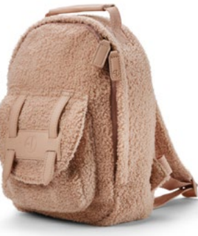
Pink Bouclé 50880202197NA