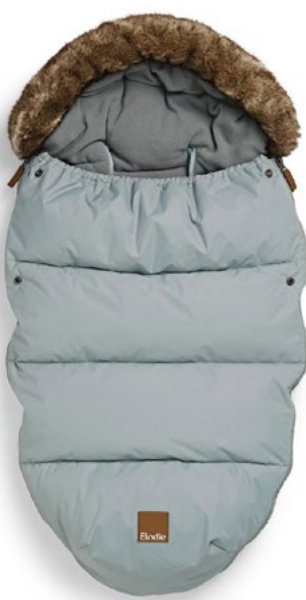
Pebble Green 50500142193NA Recycled Material