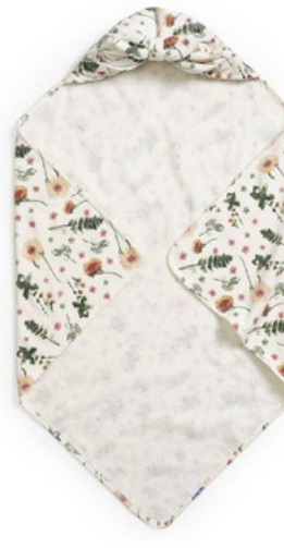
Meadow Blossom 70660137588NA