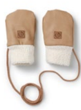
Aviator Brown 0-12m: 50620204198EC