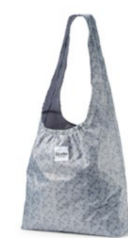
Changing Bag Free Bird 50670210412NA