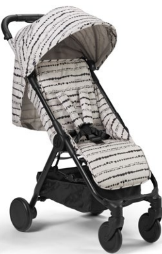
Tidemark Drops 80820121496NA