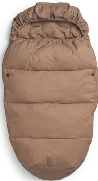
Soft Terracotta 50515120157NA