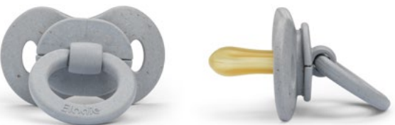
Sunrise Blue 30115106196NA Timeless