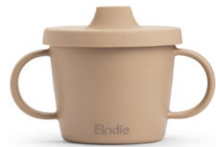
Blushing Pink 60254103151NA