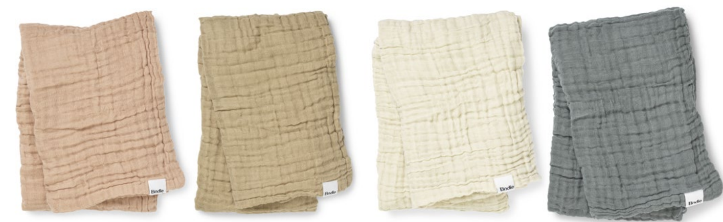
Blushing Pink 70365100151NA