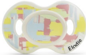
Pastel Braids 30100156403NA