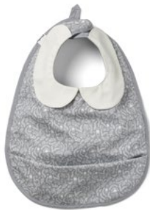
Monkey Sunrise 30400169400NA

Size: Suitable from 3 months Material: PU-treated Polyester, 100% free from PVC and Phtalates, Care: 40°C machine wash, Pcs/Pack: 10