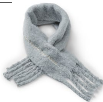
Sunrise Blue Scarf 30525200196NA