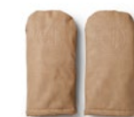
Stroller Mittens Aviator Brown 50620200198NA