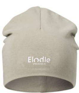
Moonshell 0-6m: 50560131112DC 6-12m: 50560131112DD 1-2y: 50560131112DE 2-3y: 50560131112DF