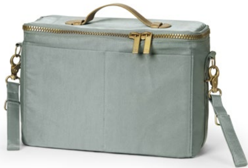
Pebble Green 50670172193NA