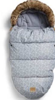
Footmuff Free Bird 50500202412NA