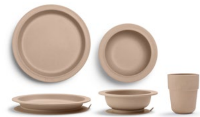
Blushing Pink 60262004151NA