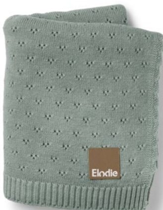
Pebble Green 30326004193NA