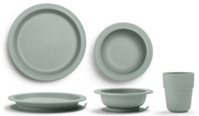
Pebble Green 60262003193NA