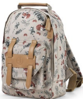
Nordic Woodland 50880144598NA