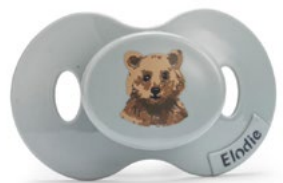
Billy the Bear 30100153858NA