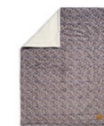
Pearl Velvet Blanket Blue Garden 30320204410NA