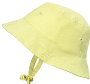
Sunny Day Yellow 0-6m: 50590103168DC 6-12m: 50590103168DD 1-2y: 50590103168DE 2-3y: 50590103168DF