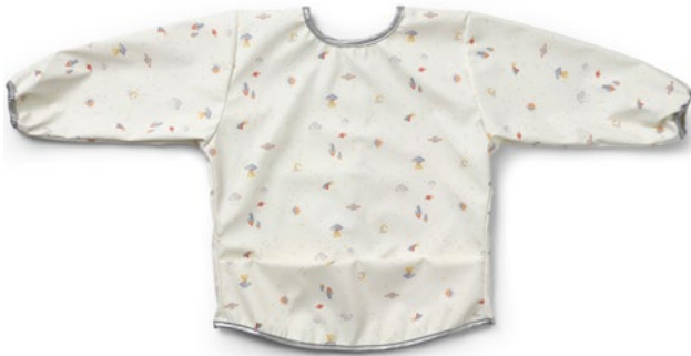
Playground Spaceland 30410111499NA*