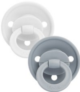
Sunrise Blue 30106106196NA