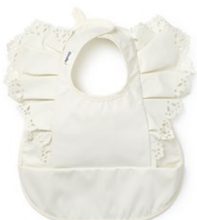
Vanilla White 30400159102NA Timeless