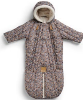
Baby Overall Blue Garden 0-6m: 50510202410DC 6-12m: 50510202410DD