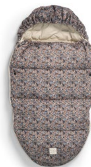
Light Down Footmuff Blue Garden 50515200410NA