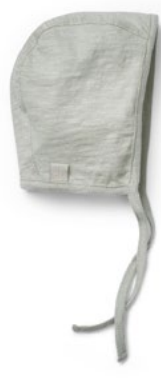
Mineral Green 0-3m: 50595100184DA 3-6m: 50595100184DB