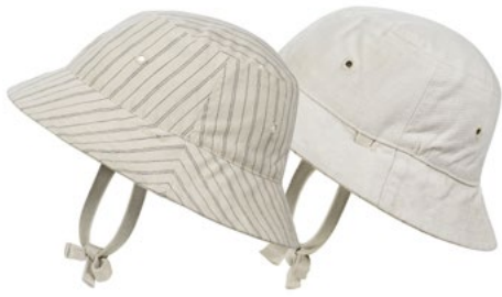
Pinstripe 0-6m: 50590109494DC 6-12m: 50590109494DD 1-2y: 50590109494DE 2-3y: 50590109494DF