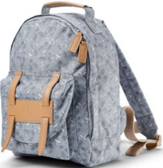
Free Bird 50880201412NA