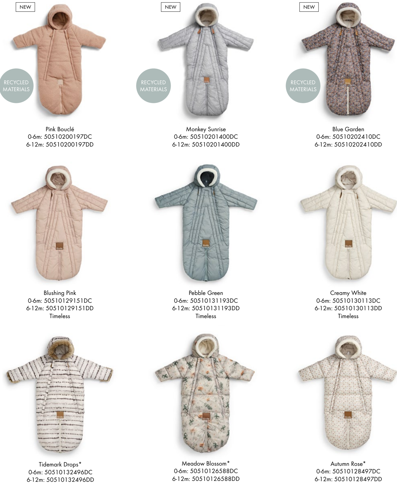
Pink Bouclé 0-6m: 50510200197DC 6-12m: 50510200197DD

Sizes: 0-6 months or 6-12 months Material: See website for details Care: 40°C machine wash and tumble dry Extra: The sleeves are lined with nylon for smoother insertion of tender little arms and can be closed off with a fold over flap to retain warmth. Pcs/Pack: 2