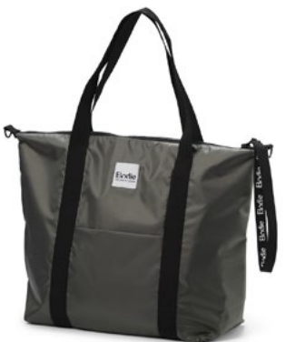
Rebel Green Soft Shell 50670134186NA Timeless