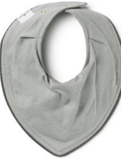
Mineral Green 30440122184NA Timeless