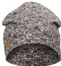
Autumn Beanie Blue Garden 0-6m: 50570200410DC 6-12m: 50570200410DD 1-2y: 50570200410DE 2-3y: 50570200410DF