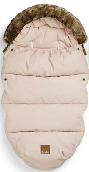
Blushing Pink 50500141151NA Recycled Material