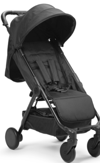
Black 80820131120NA Timeless