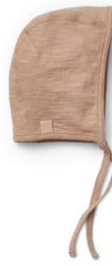
Blushing Pink 0-3m: 50595101151DA 3-6m: 50595101151DB