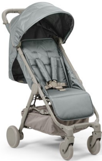
Pebble Green 80820120193NA