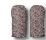
Stroller Mittens Blue Garden 50620201410NA