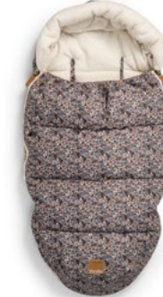
Footmuff Blue Garden 50500203410NA