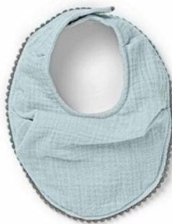
Aqua Turquoise 30440134179NA