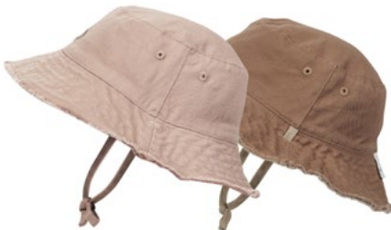
Blushing Pink 0-6m: 50590107151DC 6-12m: 50590107151DD 1-2y: 50590107151DE 2-3y: 50590107151DF