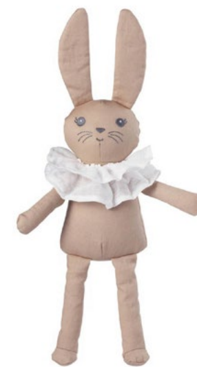
Loving Lily 70370126152NA