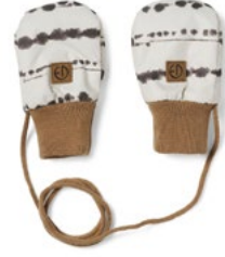
Tidemark Drops* 0-12m: 50620137496EC