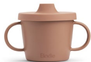
Soft Terracotta 60254106157NA