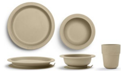
Pure Khaki 60262001116NA