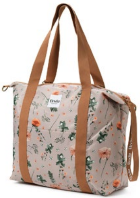
Meadow Blossom Soft Shell 50670149588NA