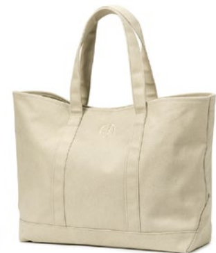
Pure Khaki Tote 50673102116NA