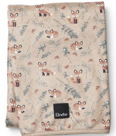
Nordic Woodland 30320138598NA