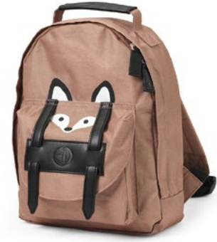
Florian The Fox 50880137654NA