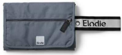
Tender Blue* 50675112190NA Timeless