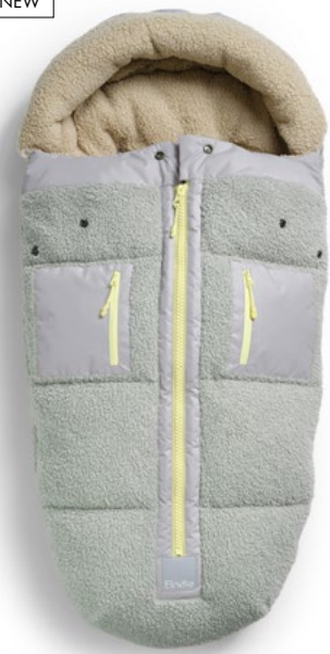
Utility Green 50500205199NA Recycled Material