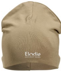
Warm Sand 0-6m: 50560120114DC 6-12m: 50560120114DD 1-2y: 50560120114DE 2-3y: 50560120114DF