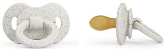
Vanilla White 30115102102NA Timeless