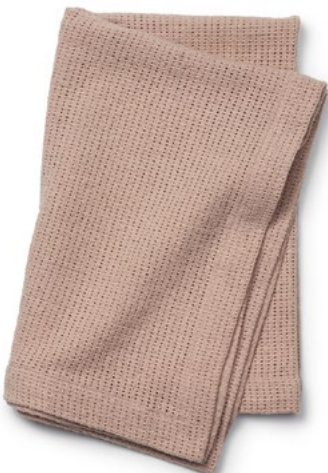
Powder Pink 30385102152NA Timeless