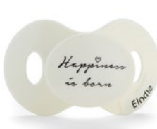
Happiness is Born 30110108710NA