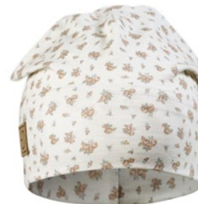
Autumn Rose* 0-6m: 50570101497DC 6-12m: 50570101497DD 1-2y: 50570101497DE 2-3y: 50570101497DF