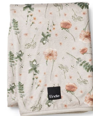
Meadow Blossom 30320137588NA