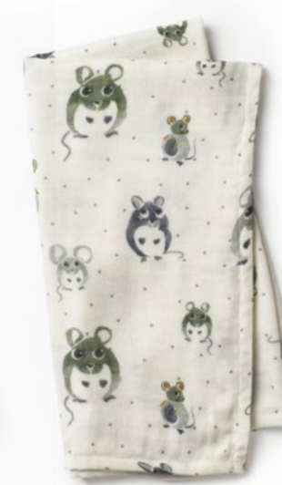
Forest Mouse 30350145587NA