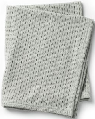
Mineral Green 30385106184NA