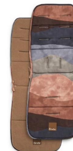
Winter Sunset 50770140526NA