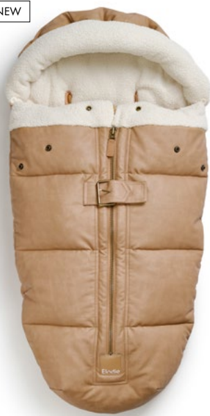
Aviator Brown 50500204198NA Recycled Material