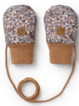
Blue Garden 0-12m: 50620203410EC