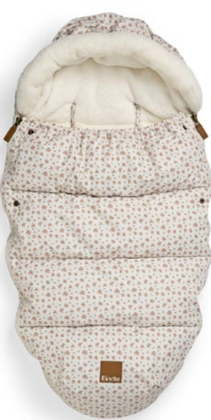
Autumn Rose 50500143497NA Recycled Material