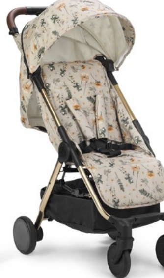
Meadow Blossom 80820135588NA