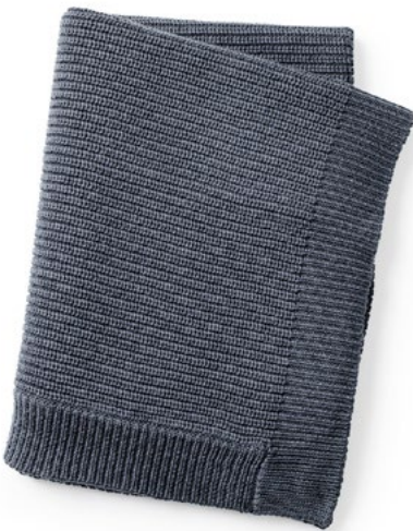
Juniper Blue 30300108192NA