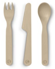
Pure Khaki 60265106116NA