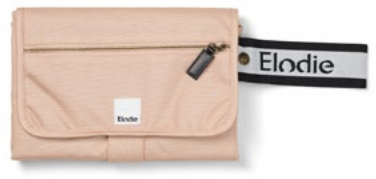
Blushing Pink 50675204151NA