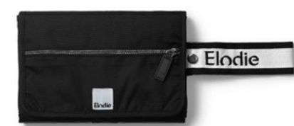
Off Black 50675113124NA Timeless