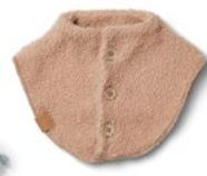
Warming Collar Pink Bouclé 30490202197NA