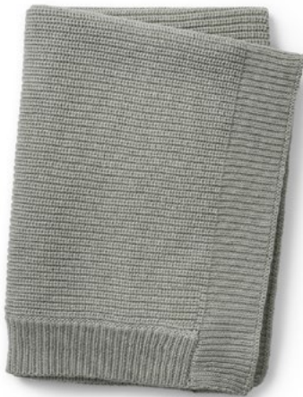
Mineral Green 30300111184NA* Timeless