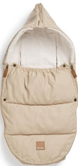
Pure Khaki 50512103116NA