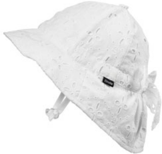
Embroidery Anglaise 1-2y: 50580133103DE 2-3y: 50580133103DF