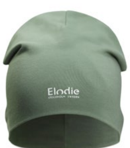
Hazy Jade 0-6m: 50560130185DC 6-12m: 50560130185DD 1-2y: 50560130185DE 2-3y: 50560130185DF

A thin yet warming Beanie made from Oeko-Tex certified material that breathes and have moisture absorbing qualities. The Cotton and Lycra blend provides a perfect elastic fit and a soft feel.