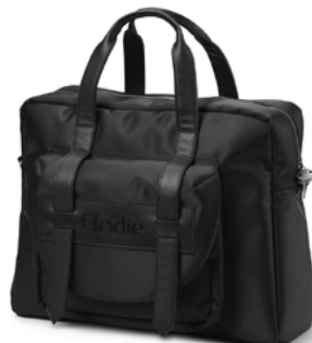
Brilliant Black Signature Edition 50670132122NA Timeless