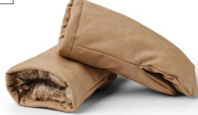
Aviator Brown 50620200198NA