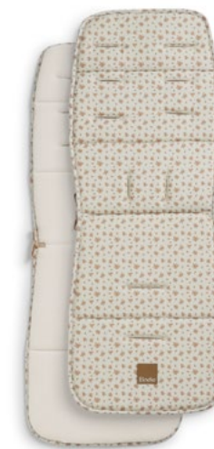
Autumn Rose 50770142497NA