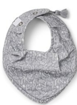
Monkey Sunrise 30440138400NA

Size: One Size, suitable from newborn Material: 95% OEKO-TEX® cotton, 5% Elastan Care: 40°C machine wash Pcs/Pack: 10