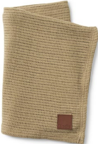
Pure Khaki 30385108116NA

Size: 75x100 cm Material: 100% Cotton Care: 30°C machine wash Pcs/Pack: 3