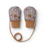
Mittens Blue Garden 0-12m: 50620203410EC