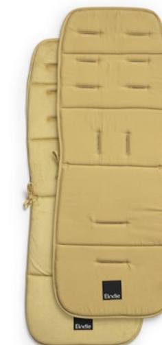
Gold 50770134172NA Timeless