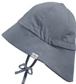
Tender Blue 6-12m: 50580130190DD 1-2y: 50580130190DE 2-3y: 50580130190DF Timeless

A classic Bucket Hat with SPF30 sun protection that shields sensitive skin on active kids. It ties under the chin to keep it firmly in place during play and ventilation holes improve the flow of air in this comfortable and cool 100% cotton hat.