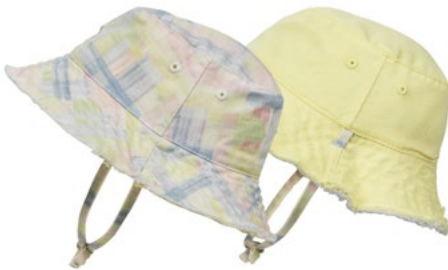
Pastel Braids 0-6m: 505901111403DC 6-12m: 50590111403DD 1-2y: 50590111403DE 2-3y: 50590111403DF

Four sizes: 0-6m, 6-12m, 1-2y, 2-3y Material: 100% Cotton, Material NEWS: 100% Organic cotton, 100% OEKO-TEX® Care: 40°C machine wash Pcs/Pack: 2