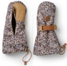
Blue Garden 1-3y: 50620203410EF