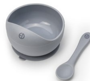
Sunrise Blue 60245104196NA

Size: Height 9 cm, diameter 12 cm. Spoon is 14,5 cm long Material: 100% Silicone. Spoon: Wood and silicone, Spoon NEW: 100% Silicone Pcs/Pack: 2