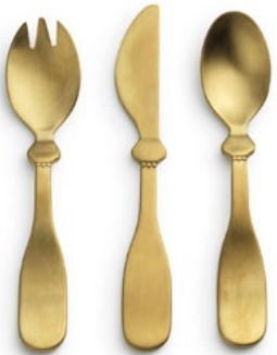
Gold 60265102370NA Timeless

A vintage antique look meets a modern anatomic shape in this high-quality feeding spoon for the youngest family members. The length and angled shaft make it easy to feed your little one. Produced entirely with polished stainless steel of the highest quality called “18/0” - they will not scratch, break, chip, rust, or dent. The polishing and finishing is made completely by hand. Designed to be used every day, yet durable enough to last a lifetime. Engrave a child’s or baby’s name on it to create a gift that can be kept and treasured over generations.