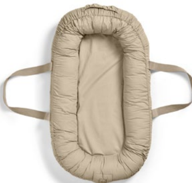
Pure Khaki 70225103116NA