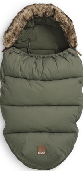
Rebel Green 50500139186NA Recycled Material Timeless