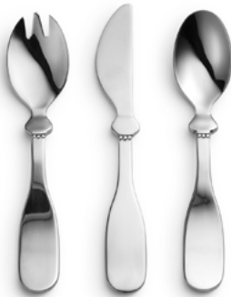
Silver 60265101360NA Timeless