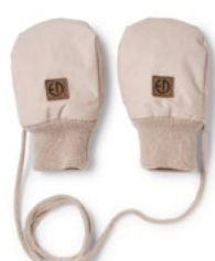
Blushing Pink 0-12m: 50620133151EC