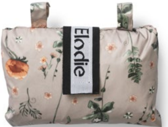
Meadow Blossom 50700135588NA