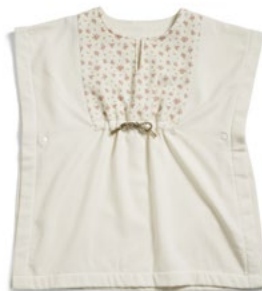
Autumn Rose 70655108859NA

Size: Suitable from 1 to 3 years Material: 100% Cotton, OEKO-TEX® certified cotton Care: 40°C machine wash Pcs/Pack: 3