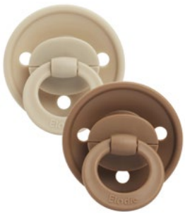
Pure Khaki 30102102116NA