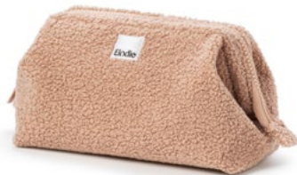
Pink Bouclé 70610202197NA