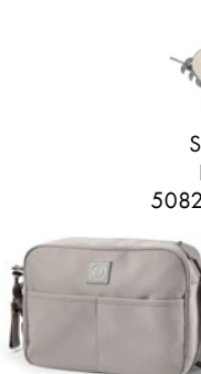
Changing Bag Moonshell 50670207112NA