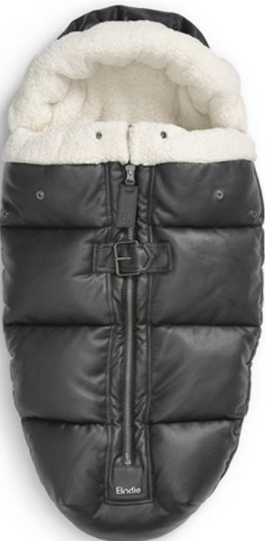
Aviator Black 50500127128NA