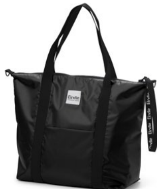
Brilliant Black Soft Shell 50670141122NA Timeless